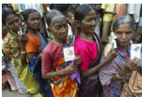
Fig. 2: Voters hold their identity cards in a queue to cast their votes in Badimunda village in Kandhamal district of Orissa, 2009, photograph

Going back to the Indian political trends of the last few years, do you think that the recent option of economic liberalism will produce more results than the socialist, centralistic vision of the first decades after Independence? How would you judge the Indian present in the light of the enthusiastically promising goals listed in Nehru's 'Tryst with destiny' speech?