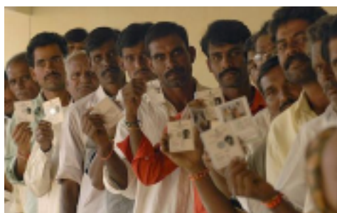
Fig. 3: Voters show their voter identity cards before they cast their ballot in Bapally, Hyderabad, 2009, photograph