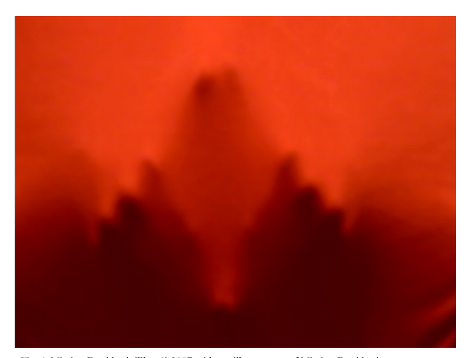
Fig. 6: Nisrine Boukhari, The veil, 2007, video still

In the act of touching and being touched, Boukhari inscribes and disseminates her personal 'signature'. She choreographs and lets emerge a corporeality that, in its becoming, slips away and displaces the writing of the body on a liquid-digital milieu, while differing the puissance or resistance of her poetical—political memory to the ones who consult, and make re-emerge, the virtual eventfulness of her work.