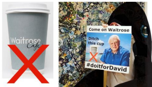
Fig. 2. Kay Mawer, “Waitrose - Stop Using Disposable and Non-Recyclable Coffee Cups NOW!”, Change.org , United Kingdom (5 February 2018). © 2019, Change.org, PBC.

Another petition, demanding the supermarket Waitrose to stop using non-recyclable cups to offer its customers complimentary coffees, also had a ‘real-life’ counterpart, documented in the image uploaded in the petition (see Fig. 2) and in online news. 76 Protesters, guided by the petitioner, campaigned outside Chichester’s Waitrose dressed as marine animals and brandishing a poster of David Attenborough, with the sea in the background, which read “Come on Waitrose Ditch this cup” and used the hashtag “#doitforDavid”. Whereas the retailer may disregard a humble citizen’s request, it might instead feel pressured to respond to Sir Attenborough’s plea.