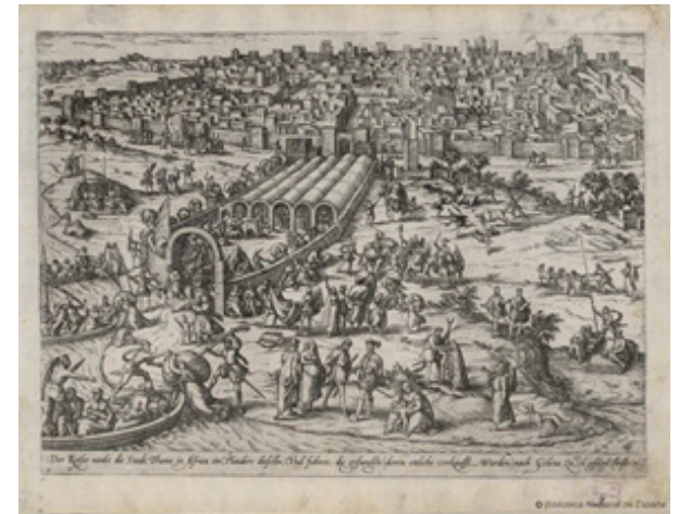
Fig. 2: Thvnis , in Franz Hogenberg, Sucesos de la Historia de Europa (1569-1570) , Biblioteca Nacional de España, Madrid, ER/ 2901.