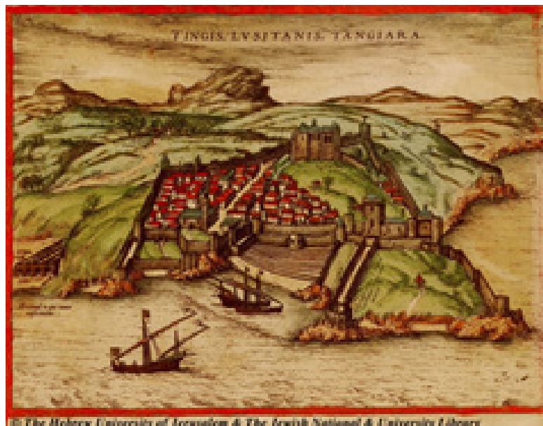
Fig. 6: Tingis, Lusitanis, Tangiara , in Georg Braun, Franz Hogenberg, Civitates orbis terrarum , Cologne 1572, vol. I, plate 56.