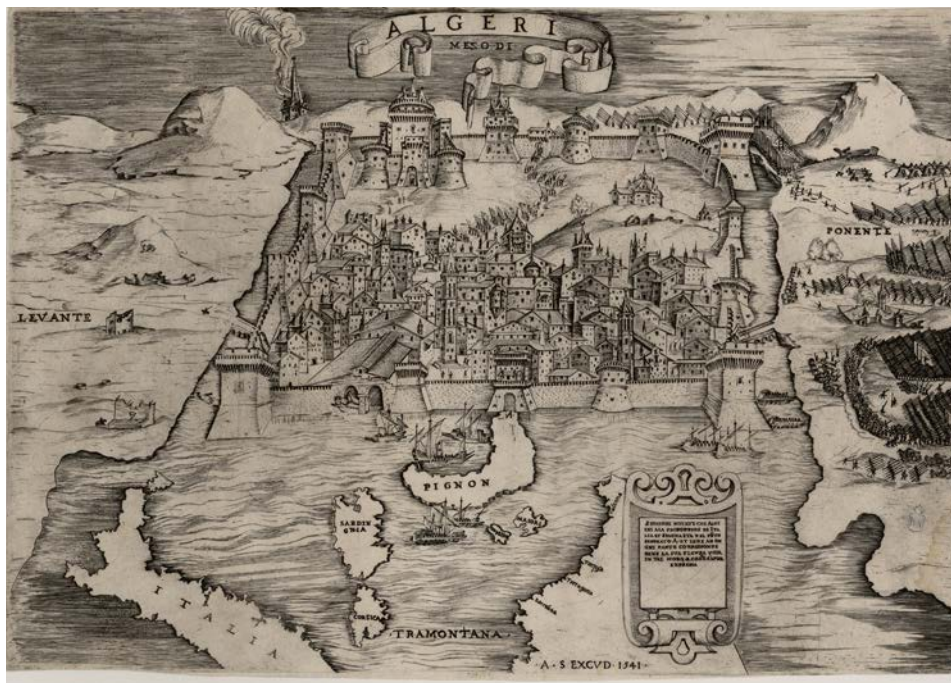
24 Fig. 10: Algeri , A[ntonio] S[alamanca] excvd, 1541. Madrid, Biblioteca Nacional de España, Invent/21886.