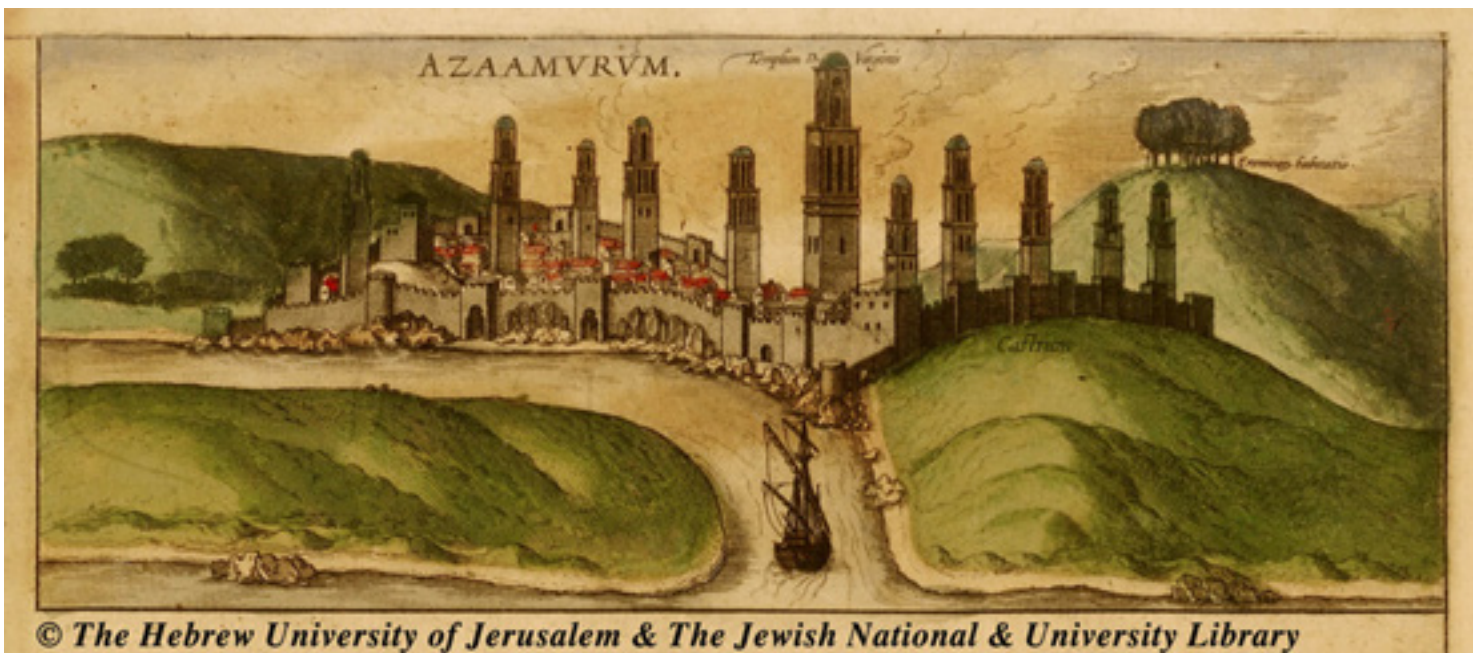
Fig. 13: Azemmour, in Georg Braun, Franz Hogenberg, Civitates orbis terrarum , vol. I, Cologne 1572.