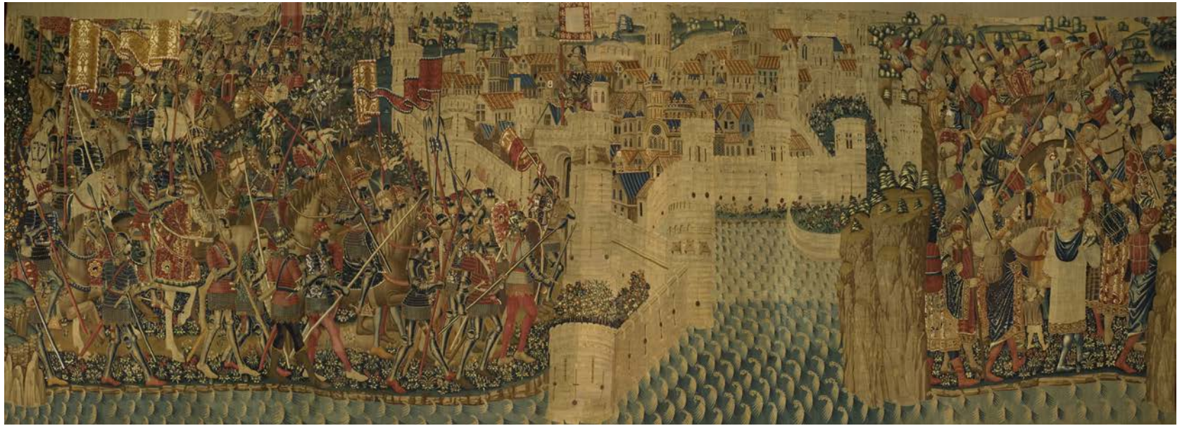
Fig. 5: Conquest of Tangier , tapestry, Pastrana (Guadalajara) Museo de la Colegiata de Nuestra Señora de la Asunción. © Fundación Carlos de Amberes. Photo: Paul M. R. Maeyaert.

plate in volume II of the Civitates that was, again, widely disseminated. Here there are obvious errors in the drawing of the city, and in the broad panorama of the peninsula, the artist has emphasized aspects of the naval attack and siege to the east and west.