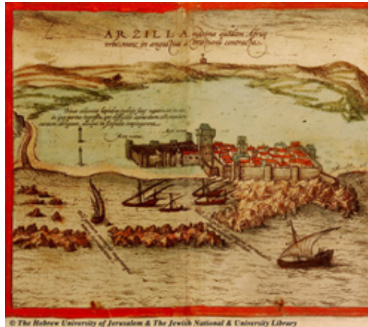
Fig. 15: Ceuta, in Georg Braun, Franz Hogenberg, Civitates orbis terrarum , vol. I, Cologne 1572.