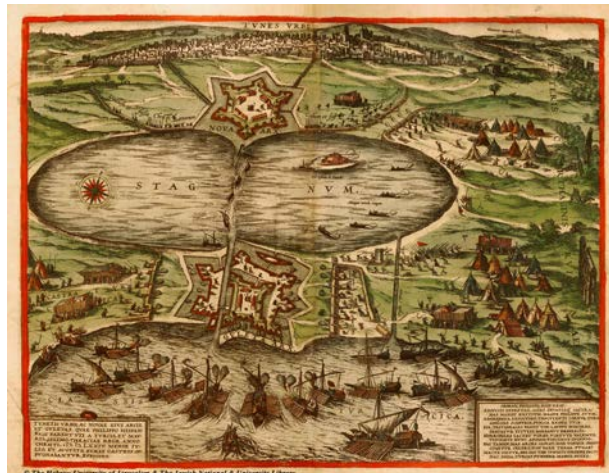
Fig. 1: Tvunes vrbs , in Georg Braun, Franz Hogenberg, Civitates orbis terrarum , Cologne 1575, vol. II, plate 58.