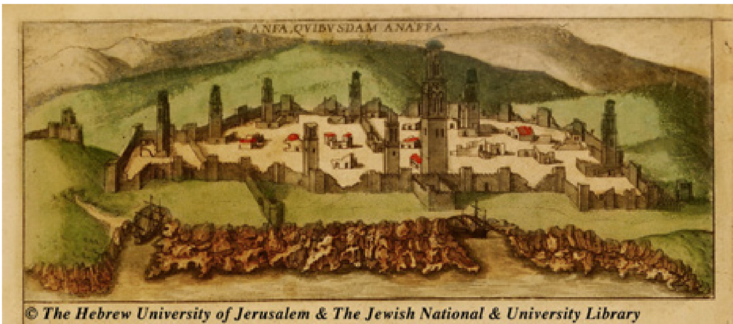
Fig. 12: Anfa, in Georg Braun, Franz Hogenberg, Civitates orbis terrarum , vol. I, Cologne 1572.