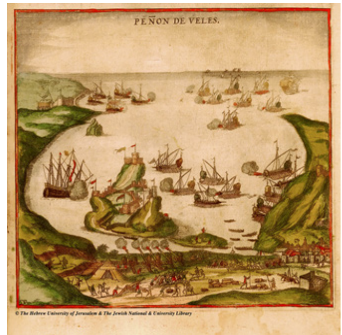
Fig. 11: Peñón de Veles , in Georg Braun, Franz Hogenberg, Civitates orbis terrarum , vol. II, plate 57, Cologne 1575.

in Lisbon in 1566 [Chronica 1926, 245; Cortesão 1935, 110-111], the Portuguese chronicler, philosopher and humanist Damião de Góis says that Duarte de Armas, whom he describes as a ‘great painter’, accompanied the Portuguese captain Jo João de Meneses in 1507 in order to make drawings of the river mouths and lands around Azammour, subsequently conquered by the Portuguese in 1513, the fort of La Marmora, Salé and Larache. The authors of the Civitates may have used them as models, however at present it is not clear they still exist. In addition, the authors of the Civitates may also have been able to use the maps and illustrations, no longer in existence, of the Moroccan coast that adorned the Esmeraldo de situ Orbis manuscript by the Portuguese cosmographer Duarte Pacheco Pereira (1505-1508) [Daveau 1999-2000, 79-132] even though they were not made by Pereira, who simply selected the images from the documentation available at that time, such as the Duarte de Armas drawings for Larache and Anife [Alegria, Suzanne, Garcia, Relano 2007, 1012].