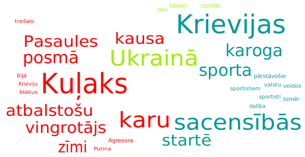
Figure 1. Visualization of the Latvian news article on the Russian gymnast Ivan Kuliak wearing letter "Z" at the awarding ceremony

Russian-language news items tend to use neutral and at times even euphemistic language in describing the war, though none of them adopted the euphemism "special military operation" used by the officials of the Russian Federation. The words used to describe the events in Ukraine include "large-scale incursion" (Appendix 2, item 1) or simply "military incursion" (Appendix 2, items 2 & 3), as well as the evasive "serious escalation of the situation" (Appendix 2, item 4) and the euphemistic "in view of the events" (Appendix 2, item 5). It is also common for the Russian-language texts of Delfi news items to refer simply to "the war in Ukraine," avoiding any epithets.