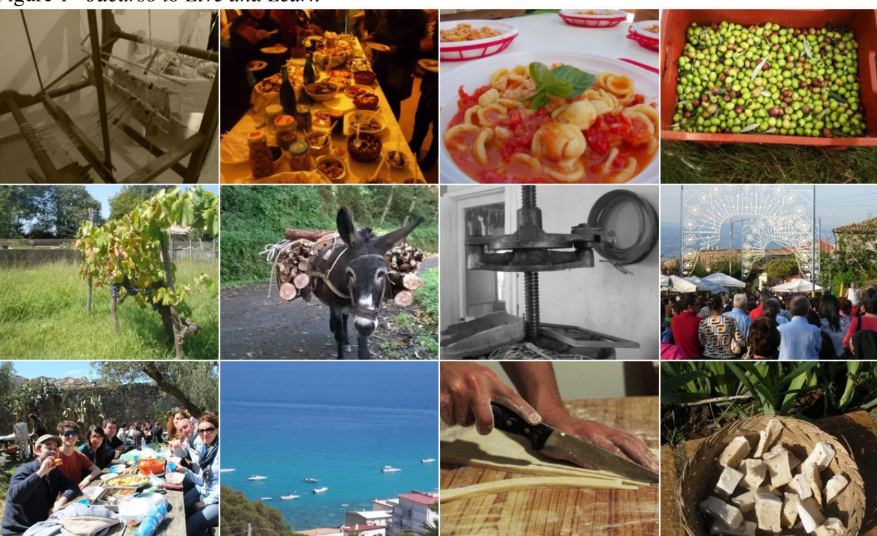
Figure 1 - Jacurso to Live and Learn