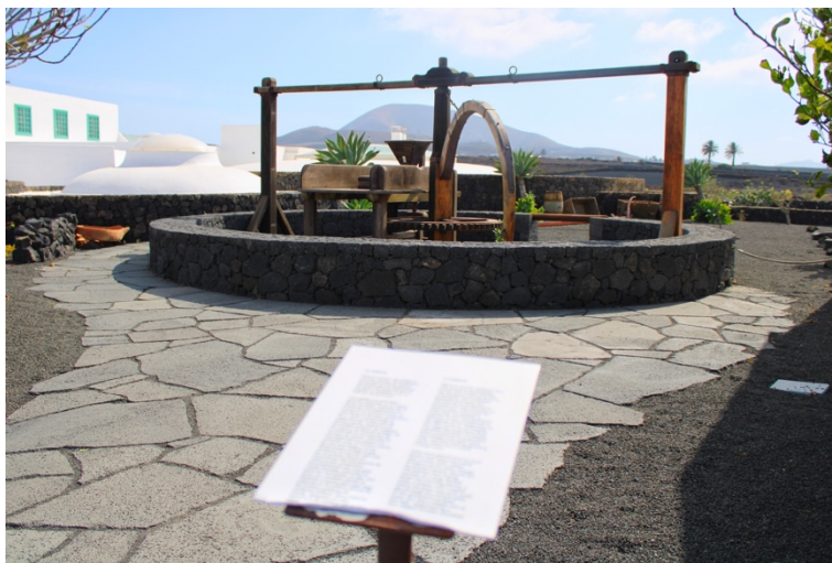
Figure 3: a flour mill (tahona) in the Casa Museo del Campesino.