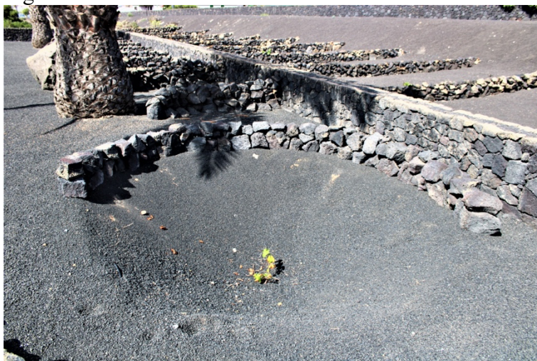
Figure 4: an example of “socos”, a typical farming technique in Lanzarote.

The Castle of San José (opened in 1976) is another symbol of the historic architecture of Lanzarote. Built between 1776 and 1779, it had no defensive purpose other than being used as a depository despite its form. When César Manrique was developing his project, the castle had been abandoned for over a century. He wanted to restore and give it new functions, and it was finally converted into the current International Museum of Contemporary Art.