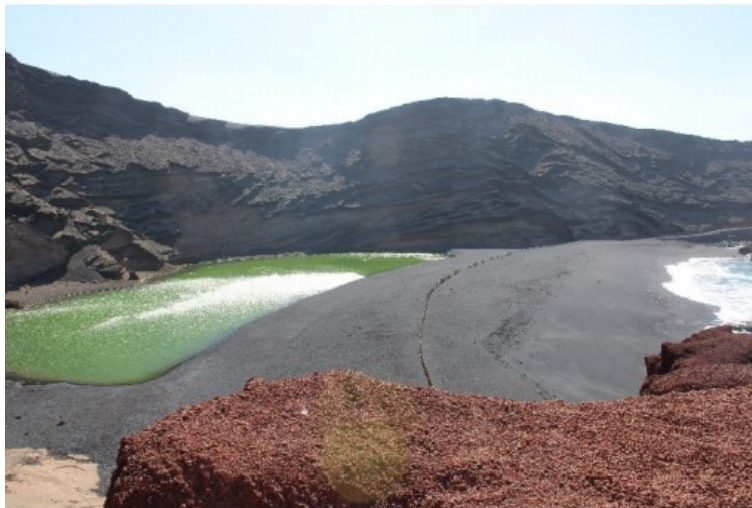
Figure 2: El Golfo and its black sand beach.

Using Lanzarote as a good example, they illustrated how stakeholders were able to develop a sustainable tourism strategy by taking advantage of the island's specific characteristics, themes and values: its distinctive natural landscapes, geological features, biodiversity, gastronomy, culture and sport and the figure of César Manrique.