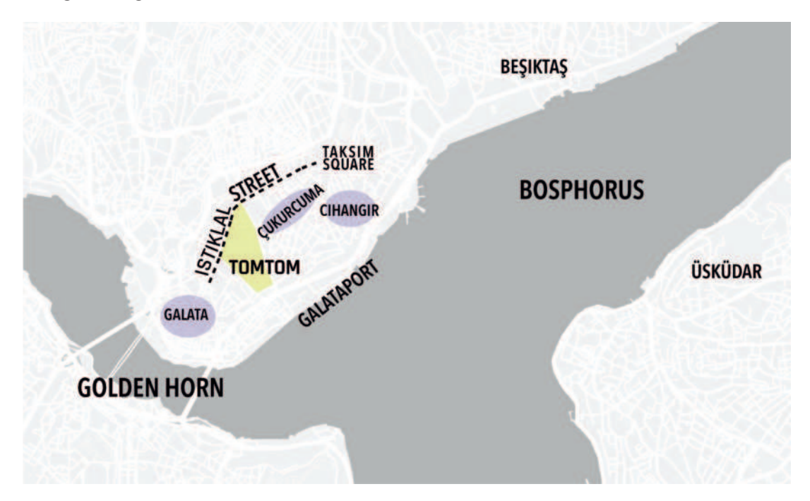
Figure 2: The location of Tomtom in Istanbul

In the case of Tomtom (Figure 2), the neighborhood branding process, although being the outcome of real estate-led gentrification work, is in practice strongly connected to its historical background, cultural richness, and being a point of attraction from the past to the present. This neighborhood takes its name from the Tomtom Kaptan Mosque, built by Tomtom Mehmet Kaptan in 1592. The neighborhood's name, formerly called "Tomtom Kaptan", changed later to being just "Tomtom". Instead of creating a new name for this neighborhood, as in NoLo, the investors introduced the neighborhood's own name as a strategic tool for urban regeneration. This strategy strengthened the idea of a comeback of the neighborhood, which the project aimed to return to its lively old days, by a real estate company. The investors and creative community of Tomtom have been involved in promoting the branding process, thus reinforcing and consolidating the neighborhood's name.