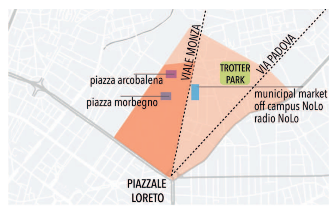
Figure 3: The case of NoLo

This dimension causes evident consequences on the perception of social and spatial exclusion concerning specific parts of the city and social categories. The strict division between the two parts is also clearly evident through the associations active in the area, such as those of traders, one for Viale Monza and one for Viale Padova, rather than the initiatives of social streets, divided between the "NoLo Social District" and "Via Padova Viva". According to some interpretations, such a duality could represent a risk for the strength of the neighborhood brand, based on a conflictual vision on "what is NoLo" and "what is out of NoLo". Anyway, this paper argues that such a duality, showing a plural dimension of different identities and representing more social forces active in the area, should instead be considered as an opportunity for the neighborhood, countering a simplified approach of the city branding which sees complexity not as an asset but as a threat.