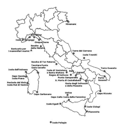
Fig. 1 - Italian MPAs