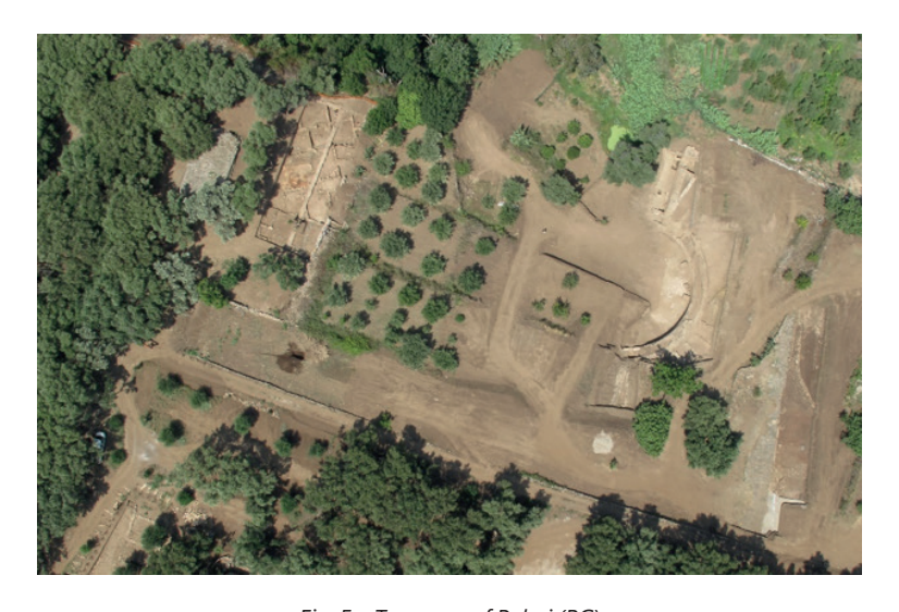
Fig. 5 – Taureana of Palmi (RC)

In addition, the new interventions will enhance the temple of Apollo Aleo in Cirò marina, the protected areas of Medma in Rosarno, Taureana of Palmi (Fig. 5), Terina in Lamezia Terme, the villa of Palaces in Casignana, the theater and the villa of Naniglio in Gioiosa Ionica, the Baths of Acconia in Curinga, the Archaeological Park of the Ionian Sila as Cariati - Terravecchia, the villa of Larderia in Roggiano Gravina, the villa of Pian delle Vigne in Falerna, the Cozzo Piano Grande in Serra d'Aiello, and will broaden the overview of the structures organized for the archaeology knowledge in Calabria.