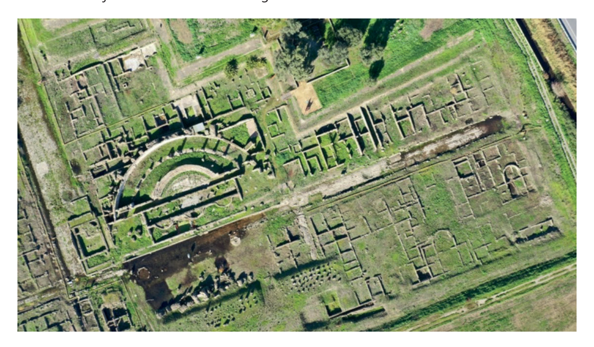
Fig. 2- Sibari (CS)

The process of creating archaeological parks embedded in the foundation of museums is marked by the evolution of field research. Officially Sibari and Scolacium have been archaeological parks since 1974 and 1982, and in recent years specific measures have been taken to improve them. The Sibari Archaeological Park (Fig. 2), despite the critical problems associated with the aquifer and the separation of archaeological zones due to SS 106, which in the next period will attempt to come up with a solution, is embedded in a beautiful landscape. The largest plain in Calabria, crossed by the Crati and Coscile rivers, stretches between the Pollino and Sila Greca mountains, defines the majestic contours which emerge from the horizon of the flat arc.