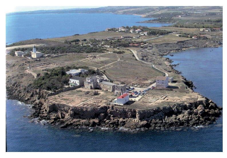
Fig. 4- Capo Colonna (KR)

In recent years in Marcellina of Santa Maria of Cedro, the archaeological area of Laos town (IV century. b.c.) have created a useful path and recently installed a small Antiquarium .