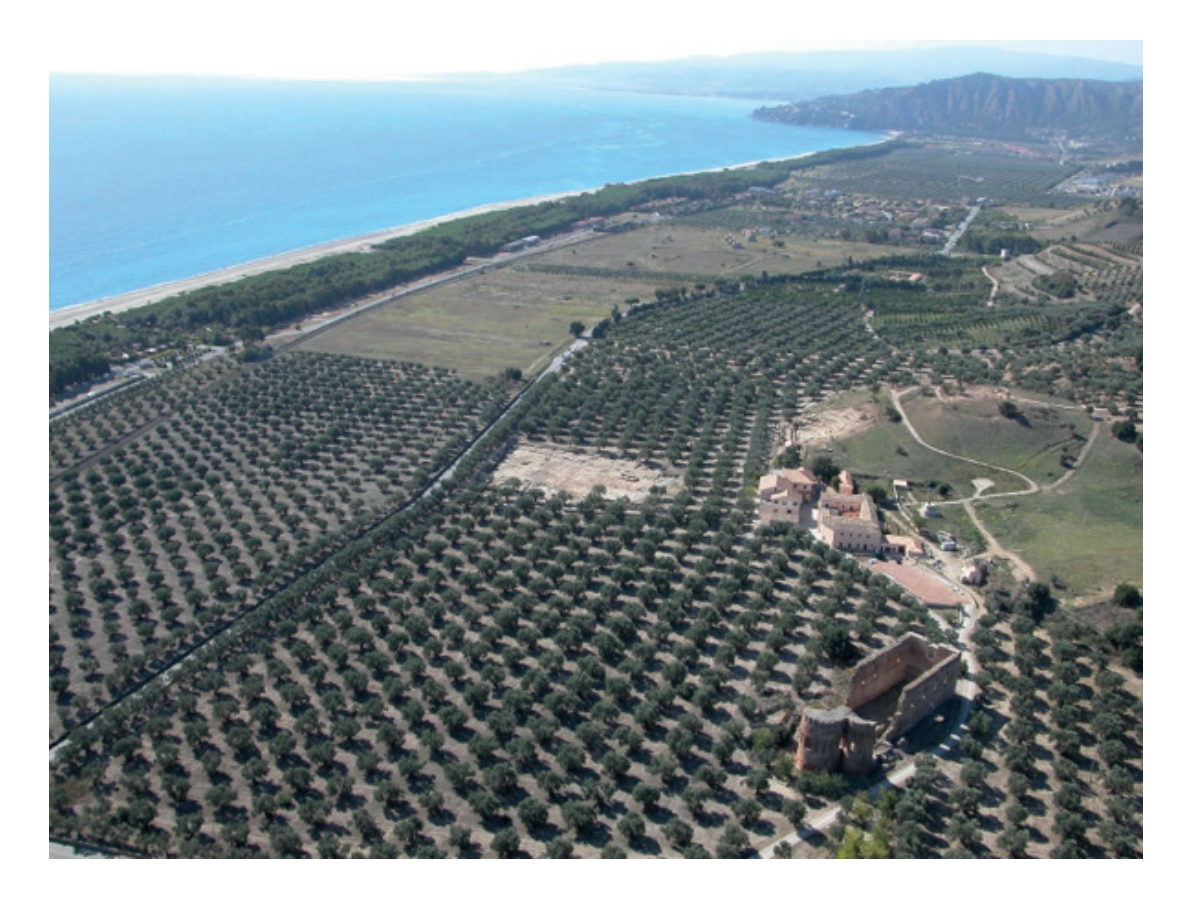
Fig. 3- Scolacium (CZ)

The former city of Locri Epizephyrii extends over 230 hectares and grows between a flat and a hilly area occupying a very large estate. The visit of the archaeological park takes place through various paths which show the private quarters, the sacred areas, the city walls, the theatre. The transformation of the colony between the Greek and Roman eras is set up in the Casino Macrì Estate, a 19th-century residence built on the remains of the Roman baths, today an exhibition place of the occupation of the town in Roman and Late Antiquity.