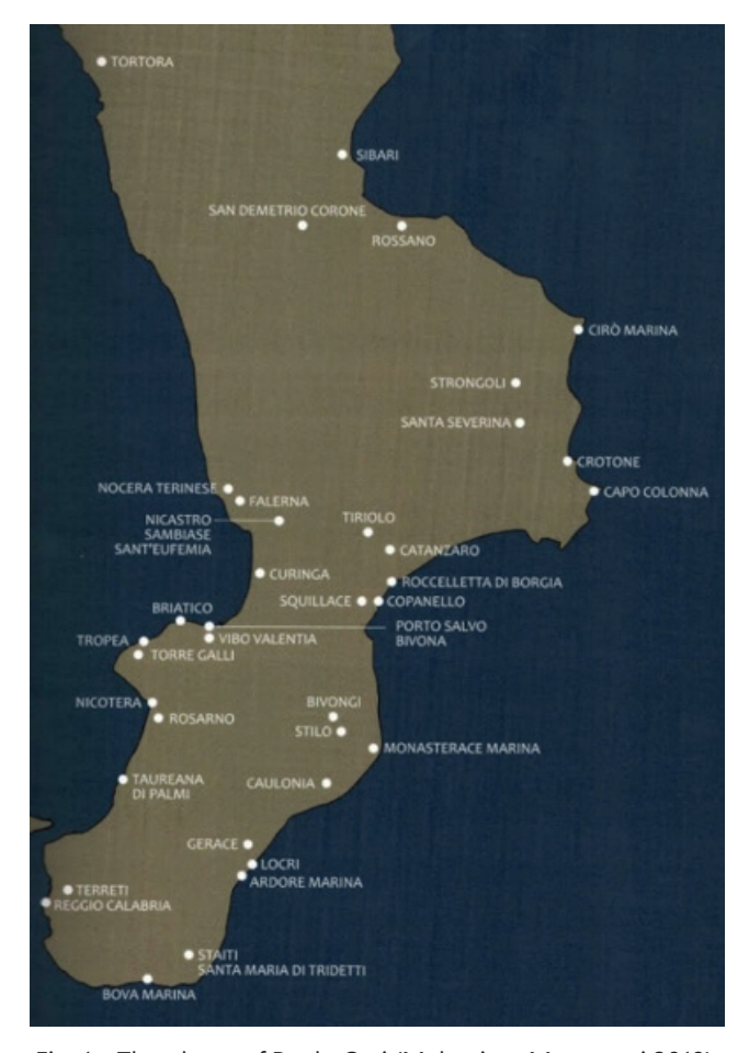
Fig. 1 – The places of Paolo Orsi (Malacrino, Musumeci 2019).

tuoro, will define the location, also thanks to the excavations carried out in the end of 800 on the plains of Cozzo Michelicchio and Torre del Mordillo.