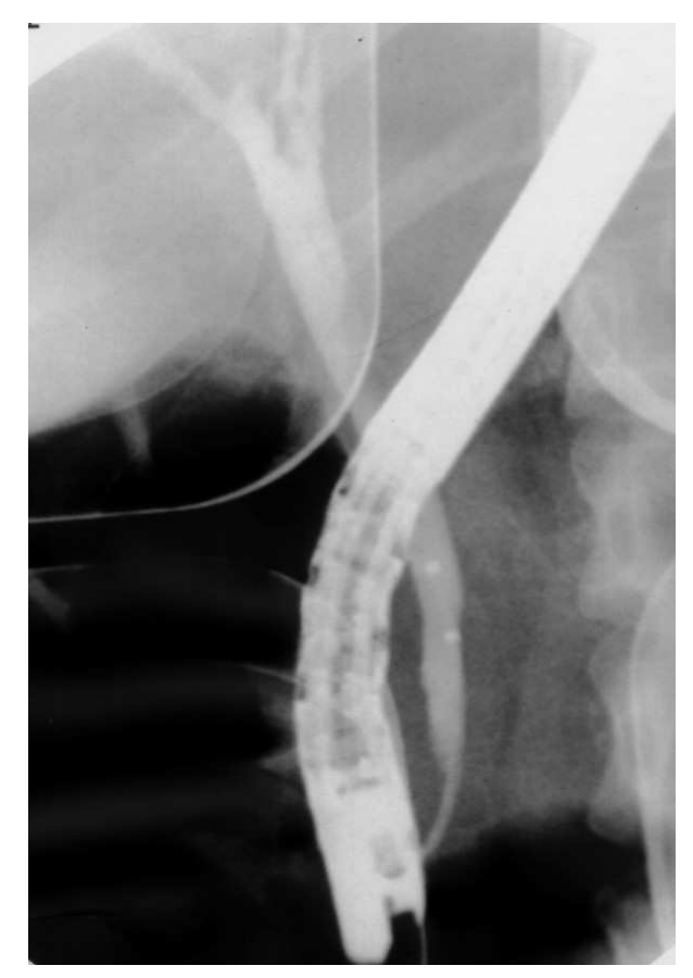
Figure 2. The cholangiogram after removal of parasite showed decreased size of common bile duct without filling defect.

amylase 2,036 U/L (reference range: 0-220 U/L). Stool testing for parasites and ova were negative for three days. Abdominal computed tomography (CT scan) showed dilated common bile duct (0.8 cm in diameter) without filling defects and no gallstone. No evidence of acute pancreatitis was found from this study. She was