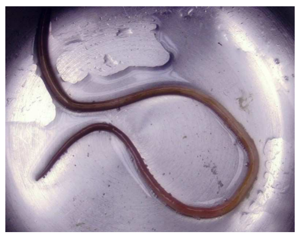
Figure 4. A 22 cm long adult form of Ascaris lumbricoides after extraction from common bile duct.

In the previous studies, 80% of the patients with biliary ascariasis had previously undergone cholecystectomy and/or sphincterotomy and they claimed that sphincterotomy leads to the development of biliary ascariasis [6]. However, there is no history of sphincterotomy or cholecystectomy in this case. In urban areas, acute pancreatitis and cholangitis associated with Ascaris lumbricoides are unusual and