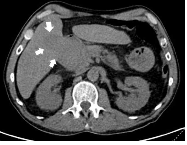
Figure 1. CT scan of abdomen showing a mass in the head of the pancreas (white arrows).

5.8x6.0 cm mass in the head of the pancreas and multiple hypodense lesions in the right lobe of liver, the largest measuring 2.8 cm (Figure 1). A PET-CT scan showed hypermetabolic activity in the pancreatic mass, liver lesions and peri-pancreatic lymph nodes. Serum CA 19-9 was elevated at 373 U/mL (reference range: 0-37 U/mL), but alpha-fetoprotein (AFP) level was within normal range. Subsequently, he underwent an ultrasound-guided biopsy of the liver. Ten days later, he presented to his physicians' office with complaints of chills and lightheadedness, and was noted to have a blood pressure of 72/48 mmHg. At that juncture, he was diagnosed with septic shock and acute renal failure