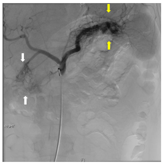
Figure 2. The celiac angiogram demonstrating: two large vascular arteriovenous malformations involving both the pancreatic head (yellow arrows) and tail (white arrows).