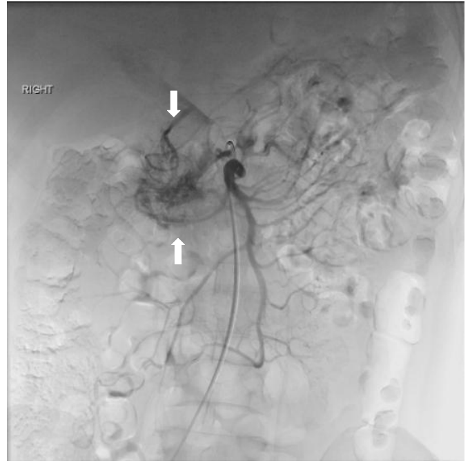
Figure 3. The superior mesenteric angiogram demonstrating: significant vascular contribution to the pancreatic head arteriovenous malformation only (white arrows).

Instead, patient underwent intraoperative irradiation therapy (IORT). During the procedure, patient was surgically operated to retract healthy organs/tissues, and then a single concentrated dose of radiation therapy was precisely applied to both pancreatic AVM lesions.