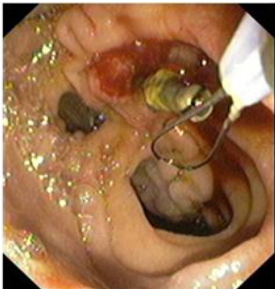
Figure 5. Stent removal after 3 months follow -up.

Although pancreatic stenting is a strategy to decrease the risk of pancreatitis attempts to cannulate the pancreatic