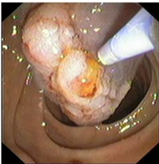
Figure 2. Submucosal injection before papillectomy.