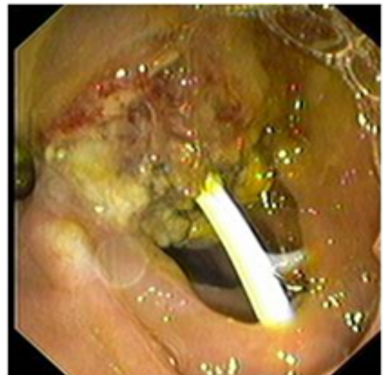
Figure 3. Biliary stent placed in the common bile duct after excision