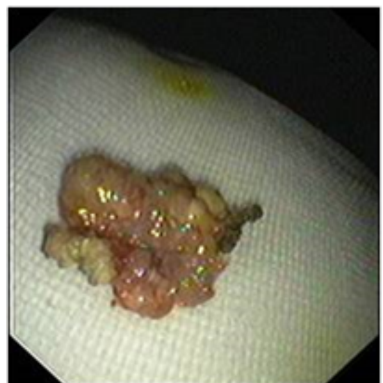
Figure 4. Resected specimen.