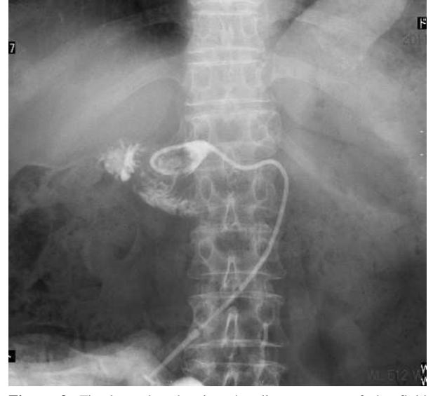
Figure 3. Fistulography showing the disappearance of the fluid collection around the pancreaticojejunal anastomosis. We confirmed the presence of an internal fistula into the intestine.

In our case, postoperative examinations in the follow-up period showed no recurrence and no metastasis after the pancreaticoduodenectomy. One year later, the patient suffered from abdominal pain and fluid collection in front of the pancreaticojejunal anastomosis, as detected by CT and US. Fortunately, the fluid collection flowed from the surface of the anastomosis. Percutaneous US-guided drainage was performed easily. One week later, a fistulography showed the disappearance of the fluid collection around the pancreaticojejunal anastomosis, and we confirmed the internal fistula into the intestine. Most pancreatic fistulas are managed non-operatively by conservative treatment. However, surgical treatment is sometimes required [20]. The exact reason for a delayed pancreatic fistula is unclear. But, it appears that a small initial amount of leakage is aggravated by infection. Barreto et al. [21] discussed the gray zone between a pancreatic fistula and post-operative