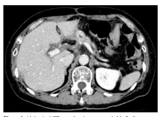
Figure 1. Abdominal CT scan showing no remarkable findings.

passed through the seromuscular layer of the jejunum, in the posterior-to-anterior direction, wide enough to cover the cut surface of the pancreas. A catheter with multiple side-holes was inserted into the pancreatic duct and sutured into place as an external stent. The stent tube was guided externally through the stump of the jejunal loop and fixed to the abdominal wall. Histological and immunohistochemical studies resulted in the diagnosis of a biliary carcinoma with lymph node metastases. The postoperative course was uneventful and the patient was discharged from the hospital 16 days postoperatively. The external stent of the pancreatic duct was removed on the 28th postoperative day. After removal, there was no output of fluid from the drain. After discharge, the patient was followed up with computed tomography (CT), ultrasonography (US), and laboratory examinations every 3 months in the outpatient ward. No notable findings were obtained (Figure 1). One year after