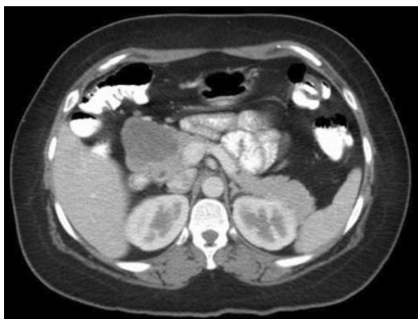
Figure 1. CT scan showing a 5.9x5.6 round cystic mass at the head of the pancreas in a 33-year-old female (Case #1).

malignancy. On examination she was obese and there was mild diffuse abdominal tenderness in all quadrants, as well as a palpable mass on left upper quadrant. All blood tests were normal, including tumor markers. Abdominal ultrasound showed a 5.4x5.2 cm heterogeneous mass at the head of pancreas. Abdominal CT scan disclosed a 5.9x5.6 cm round cystic mass at the head of the pancreas and retroperitoneal lymphadenopathy (Figure 1). Fine-needle aspirates of the pancreatic lesion demonstrated features suggestive of solid-cystic pseudopapillary tumor of the pancreas. She underwent pylorus-preserving pancreaticoduodenectomy, done by surgical team. None of the 21 lymph nodes recovered were positive for malignancy. Microscopic analysis revealed sheets of uniform polygonal cells with a pseudopapillary appearance (Figure 2). Results of immunoperoxidase stains showed tumor cells that were positive for CD10, vimentin, CD56, cyclin D1. Postoperative period was complicated with enterocutaneous fistula. The patient was subsequently discharged after 2 weeks. CT scan performed 3 months postoperatively showed no evidence of disease recurrence.