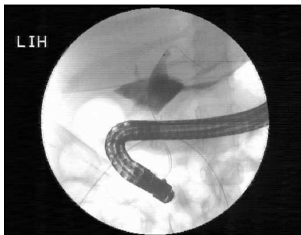
Figure 2. Initial ERCP showing a leaking bile duct, biliary sphincterotomy and stenting.