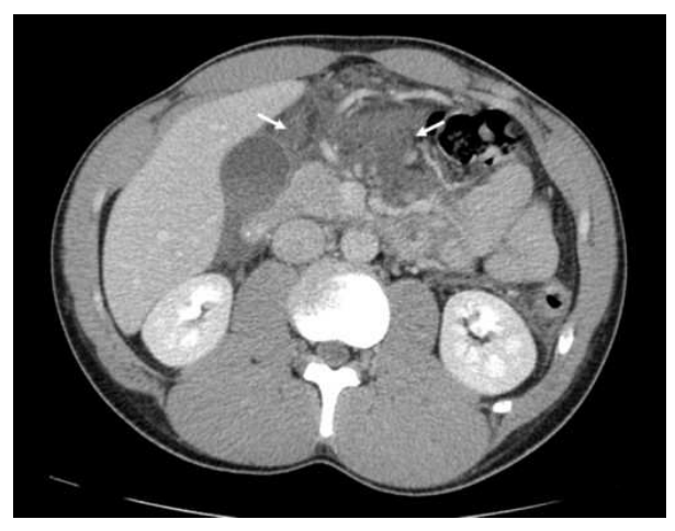
Figure 2. Large amount of high attenuation fluid in the lesser sac and around the pancreas consistent with hemorrhagic reaction (arrows).

Management of the pancreatic stump after distal resection is controversial. Numerous techniques are described in the literature including duct ligation, handsewn or stapled closure, ultrasonic dissection, meshes and omental patches, as well as biologic glues and other sealants. No method has proven superior for preventing postoperative fistulas or leaks [11, 12, 13, 14]. Roux-en-Y pancreaticoenterostomy is another option but many believe the complexity of this procedure as well as reportedly higher leak rates make this unsuitable for traumatic injury [1, 3, 15]. Direct duct ligation was not possible in our patient and some authors question the necessity of this step to begin with [7, 16]. In addition, we felt that most methods of