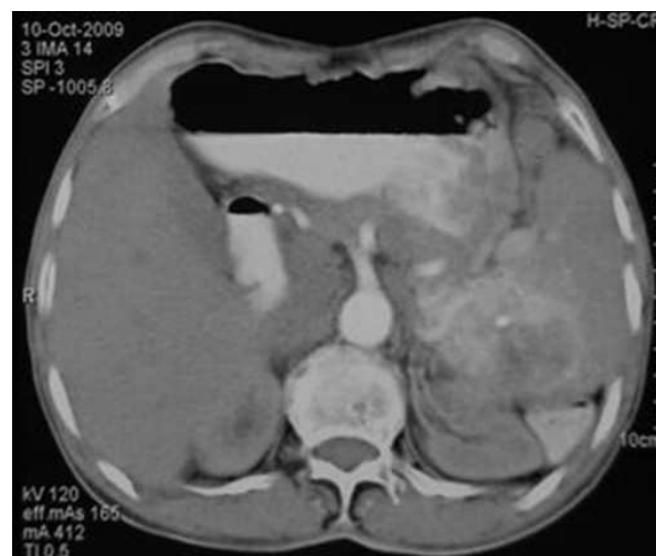
Figure 1. Postcontrast axial CT scan in the arterial phase showing a solitary large contrast-enhanced lesion in the spleen.

The patient underwent an exploratory laparotomy. Intraoperatively, a 4.5x4.3 cm tumor seen mainly at the splenic hilum invading the splenic parenchyma, extending to the tail of the pancreas and encasing the splenic vein. The splenic flexure of the colon was adherent to the spleen which showed infiltration by the tumor. A distal pancreatectomy and splenectomy were carried out along with resection and anastomosis of the splenic flexure of the colon. There were no enlarged lymph nodes. The postoperative course was uneventful.