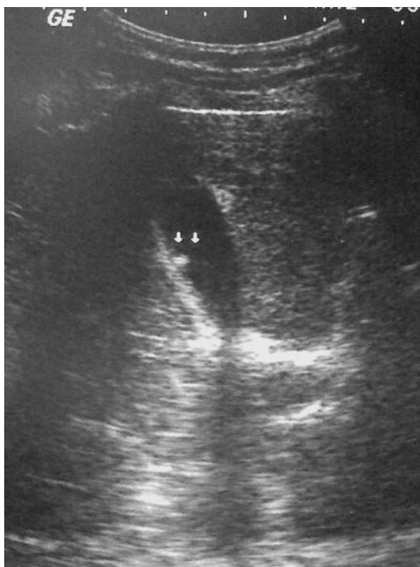
Figure 1. An echogenic non-mobile structure attached to the gallbladder wall (small arrows) with no posterior shadowing. Features suggestive of a polyp.

heterotopia of the gallbladder have been reported in the medical literature published in English, as shown by the database of medical search engines: PubMed ( http://www.ncbi.nlm.nih.gov/pubmed/ ) and OVID ( http://www.ovid.com/site/index.jsp ) [1, 4, 5, 6, 7, 8, 9, 10, 11, 12, 13, 14, 15, 16, 17, 18, 19, 20, 21, 22, 23, 24, 25, 26, 27, 28, 29, 30].