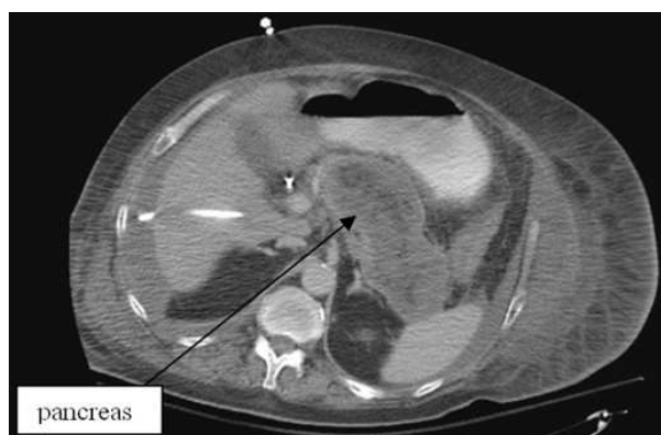
Figure 1. CT scan of the abdomen with contrast (Case #1).

range: 0-160 mg/dL). Serum amylase and lipase levels were 33 U/L (reference range: 36-128 U/L) and 15 U/L (reference range: 8-57 U/L), respectively. Ultrasound of the abdomen revealed a common bile duct diameter of 1.3 cm, cholelithiasis, ascites, an edematous pancreas and a diffusely echogenic liver. Abdominal CT scan with intravenous contrast confirmed the ultrasonographic findings showing ascites, diffuse pancreatitis and gallbladder distension with stones (Figure 1). Patient was hemodynamically unstable for surgical intervention. The hospital course was complicated by septic shock, worsening azotemia, and respiratory failure requiring fluids, vasopressors, broad-spectrum antibiotics, percutaneous cholecystostomy, mechanical ventilation and dialysis. The patient's condition deteriorated over 3 weeks ending with his demise. Serum amylase and lipase levels throughout the hospitalization remained normal. Autopsy revealed severe acute necrotizing pancreatitis with centrilobular hemorrhagic necrosis of the liver and cholestasis.