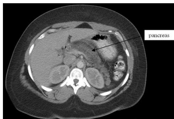
Figure 2. CT scan of the abdomen with contrast (Case #2).

A 37-year-old African-American female was admitted with complaints of epigastric pain and emesis for one day. She denied any change in bowel habits, fever, cough or hematemesis; however she did admit to alcohol ingestion two days prior to admission. She related a history of moderate alcohol consumption and an episode of pancreatitis three years prior. There was epigastric tenderness on physical examination. Laboratory tests showed WBC 9,800 cells/mm 3 , normal liver enzymes (AST 22 U/L; ALT 16 U/L; alkaline phosphatase 55 U/L; total bilirubin 0.6 mg/dL), normal serum triglyceride level (54 mg/dL); amylase and lipase were 95 U/L and 31 U/L, respectively. CT scan of the abdomen with intravenous contrast showed swelling of the head and body of the pancreas with peripancreatic inflammatory changes consistent with acute pancreatitis (Figure 2). Abdominal ultrasound revealed a common bile duct diameter of 3 mm, no gallbladder wall thickening or gallstones. The patient was treated with intravenous fluids and analgesics. Amylase and lipase levels remained normal throughout the admission. Three days