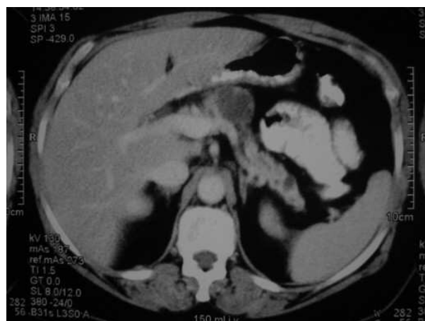
Figure 2. Contrast-enhanced CT depicting two cystic lesions at the body and tail of the pancreas.

Von Hippel-Lindau disease is an inherited syndrome caused by deletions or mutations in a tumor suppressor gene (VHL gene) mapped to human chromosome 3p25 [1]. Affected individuals can develop central nervous system lesions including cerebellar, spinal cord, brainstem, nerve root and supratentorial hemangioblastomas as well as retinal hemangioblastomas and endolymphatic sac tumors. The main visceral manifestations of the disorder include renal cysts and carcinomas, pheochromocytomas, pancreatic cysts, neuroendocrine tumors and serous cystadenomas as well as epididymal and broad ligament cystadenomas. Its clinical manifestations present in the second decade of life and its penetrance reaches 90% by the age of 65 years [2]. Renal cell carcinoma is the main malignant tumor in von Hippel-Lindau disease and is usually the leading cause of death. Its prevalence is estimated between 24 and 45%. The overall incidence of renal lesions (including renal cysts) is 60% [2, 3, 4], with the mean age at presentation being 39 years. Renal lesions are often multiple, multifocal and bilateral. They usually remain asymptomatic for long intervals and