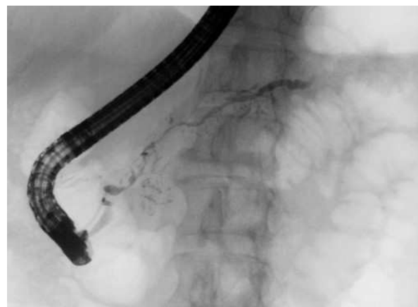
Figure 1. Endoscopic retrograde cholangiopancreatography showing diffuse irregular narrowing in the head and body of the main pancreatic duct.

The patient was a 68-year-old woman who was admitted to our hospital due to liver function test abnormalities [7]. Endoscopic retrograde cholangiopancreatography (ERCP) revealed diffuse irregular narrowing in the head and body of the main pancreatic duct (Figure 1) and strictures of the hilar hepatic region