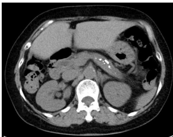
Figure 2. Abdominal CT showing multiple pancreatic stones in an atrophic pancreas.

and intrapancreatic bile duct. Abdominal computed tomography (CT) demonstrated diffuse enlargement of the pancreas. Four years after clinical onset, ERCP revealed longer strictures of the hilar hepatic region and intrapancreatic bile duct. In addition, the right lobe of the liver was atrophic. CT angiography revealed stenosis of the right branch of the portal vein. Laboratory tests showed elevation of the IgG4 level to 146 mg/dL (reference range: 4.8-105 mg/dL) and a positivity for antinuclear antibody with a titer of 1:320. The patient was diagnosed as having type 3 sclerosing cholangitis with autoimmune pancreatitis on the basis of our classification [2] and the Japanese diagnostic criteria for autoimmune pancreatitis [8]. However, steroid therapy was not initiated at the patient's request [7].