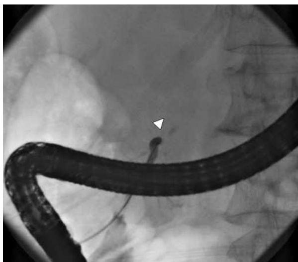
Figure 3. Endoscopic retrograde cholangiopancreatography showing obstruction of the main pancreatic duct in the head of the pancreas (arrowhead).

Seven years after clinical onset, abdominal CT revealed multiple pancreatic stones in an atrophic pancreas (Figure 2). ERCP (Figure 3) and magnetic resonance cholangiopancreatography (MRCP) revealed