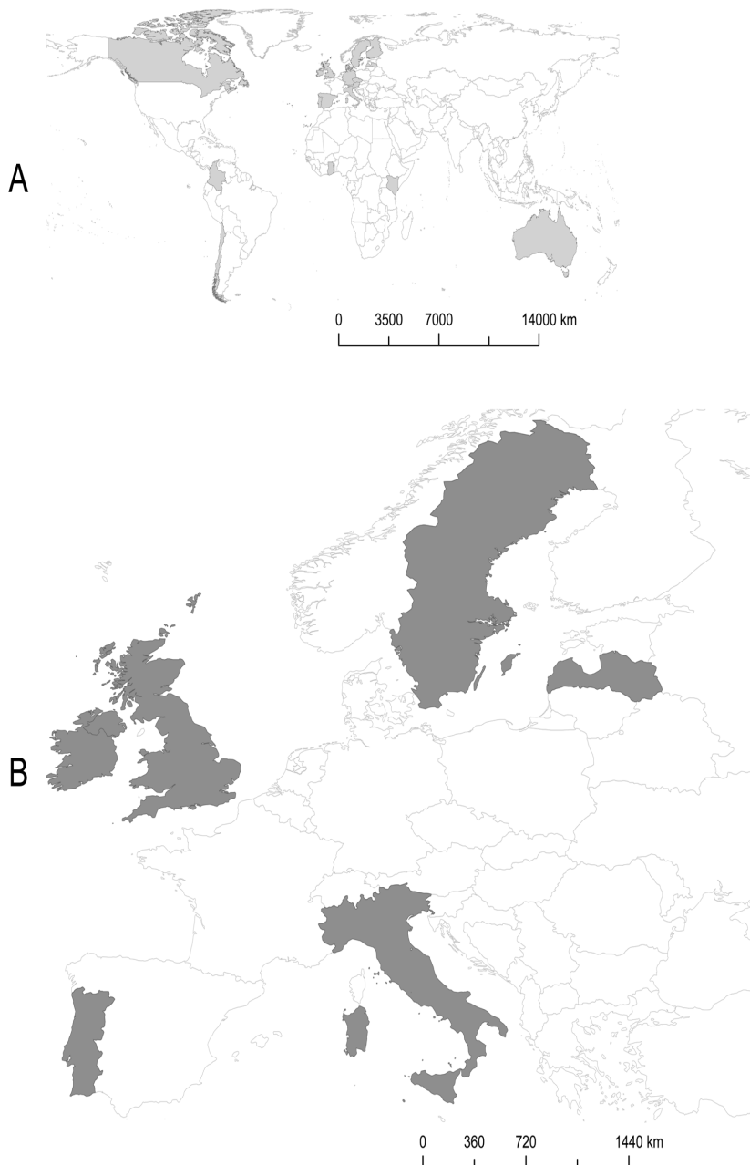
Fig. 1 Localization of the countries issuing SEA guidelines included in the first screening (part A) and finally selected (part B)

national juridical system well after the expected deadline (June 2004). Fig. 1 shows the localization of the countries, whose SEA guidelines were included in the first screening (in light grey) and finally selected (in dark grey). The guidance documents selected are described in Tab. 2.