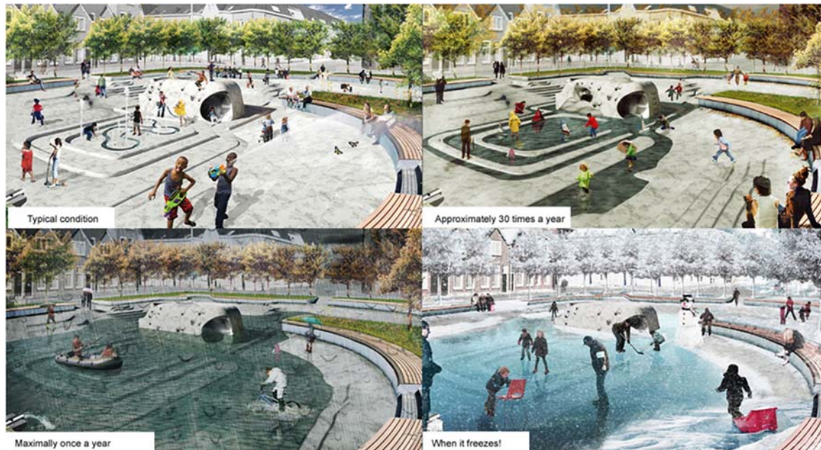
Fig. 4: Water squares in Rotterdam. (City of Rotterdam, 2013)

and businesses, and will remain so in the future. A healthy delta city in which it is pleasant to live, work and spend leisure time.