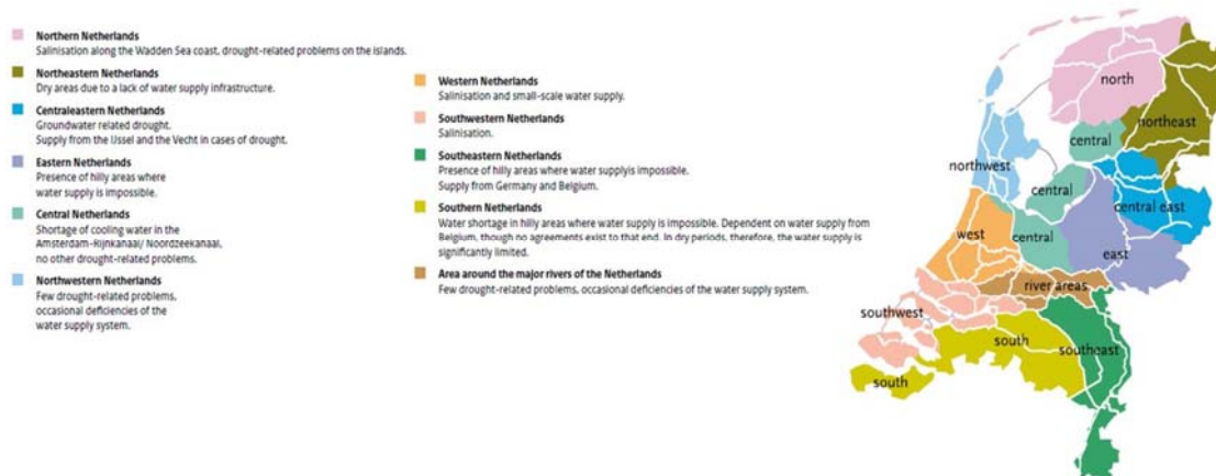
Fig. 1: Water in the Netherlands

The Netherlands is getting wetter, dryer and saltier. The sea level is rising. While rainfall is getting heavier at times, it may also at other times hold off much longer. Soil subsidence continues, due to both geological influences and human activities. Land use is changing as well, the economic sectors are continuously changing and, societally speaking, new demands are made on water. All this can hardly indicate anything else than the necessity for a change in water management and water use.