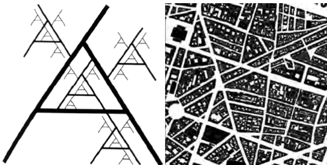
Fig. 3 A free scale network (left) and the Parisian street network (right)

Historical cities, over the course of their long history, were slowly transformed by incremental phenomena of destruction and reconstruction of the urban fabric. Structures that were not resilient enough were eliminated. And so historical cities have come down to us with extraordinary capacities of efficiency and resilience. In a process of ongoing, spontaneous self-organization to adapt their forms to fluctuations in their environment, historical cities acquired the capacity to absorb fluctuations by reinforcing their structure and order, and becoming more complex and richer as a result of the changes that take place in them.