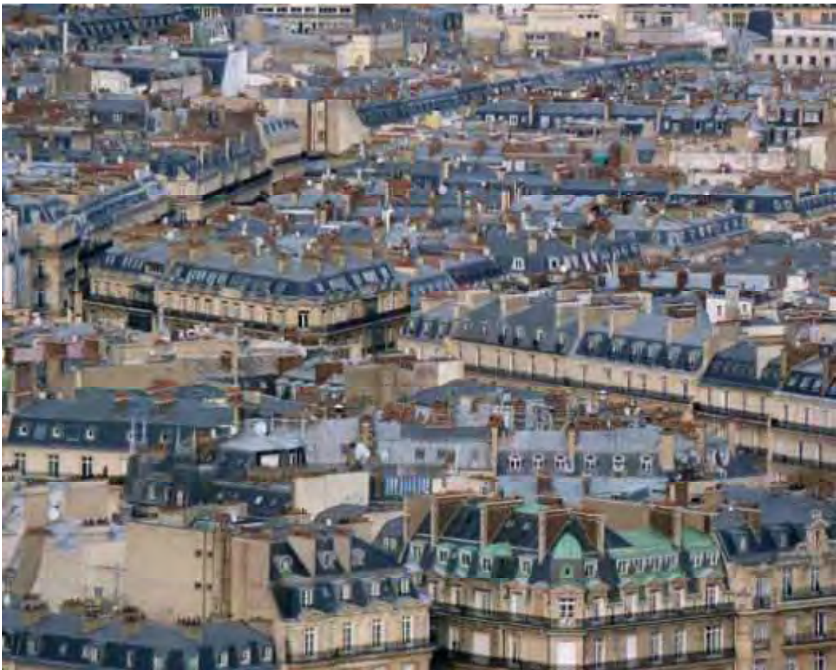
Fig. 1 Haussmannian Paris

The question is all the more important insofar as the fragility of modern cities is structural: they have exposed themselves more to risks by becoming more and more artificial and incorporating energies that are