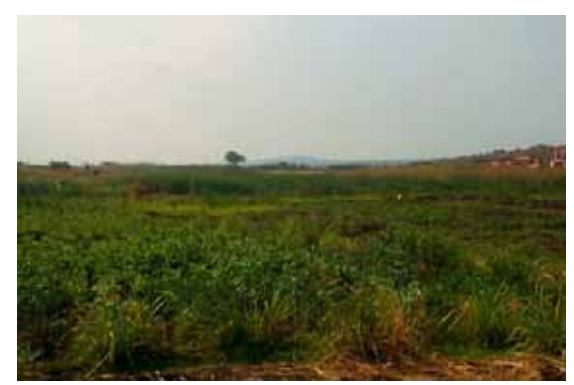
Fig. 6 Brown landscapes in the residential space