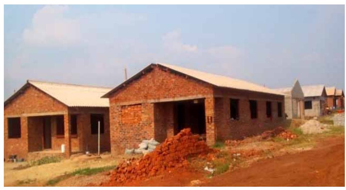
Fig. 5: Unsustainable conventional construction of houses

The local residents had no conscience of their extinction out of ignorance and lack of option to address urban poverty. There are no mechanisms in place to protect urban wildlife from human interference. The residential settlements are just conventional landscapes devoid of wildlife habitats, and the human species forget to incorporate what used to habitat there before artificial development due to agricultural practices (see Figure 7).