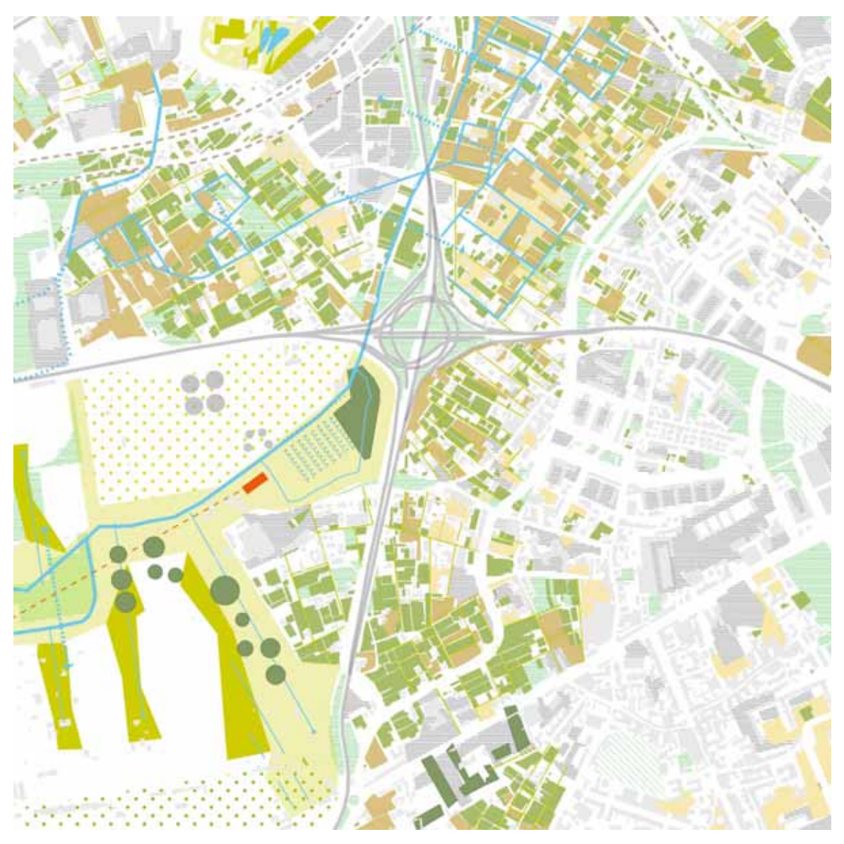
Fig. 3 the rural scape in East Naples