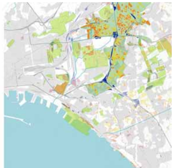
Fig. 1 Esat Naples: aerophotogrammetry and land use

The Piana Campana region is crossed by Regi Lagni, eighteenth-century canals, designed by engineer Domenico Fontana. The general aim of the project was the reclamation of marshes near Acerra city. These territories were taken away from water: for this reason, water can be considered as a primary landscape element here. Therefore, water represent a key landscape element for the East area of Naples as well, but today drosscapes occupy the 40% of all the territory. The area is almost totally urbanized, and territory is nearly completely consumed. There are industrial abandoned enclaves, urban abandoned settlements in the peri-urban spaces and technological machines. The rural-scape is fragmented and eroded by urban low density dispersion, by greenhouses and by other kinds of hybrid spaces as parking lots, logistic platforms, are underutilized or not utilized areas.