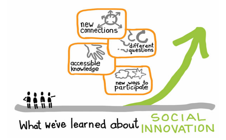
Fig. 1 About a focus on social innovation

In the definition and development of smart cities, the social innovation, therefore, is not only a more or less radical idea, but an innovative practice that aims to create a positive impact for society that is as wide as possible. It is to be understood as the capacity, the ability, the strength of a society to understand, analyze and solve its social and environmental problems and takes the form of ideas, actions, strategies, processes and projects whose impact is to the benefit of the community and not individual promoters. The practices of social innovation, in fact, not only respond in an innovative way to some needs, but also offer new ways of decision and action, through the creation of networks and using forms of coordination and cooperation rather than vertical forms of control.