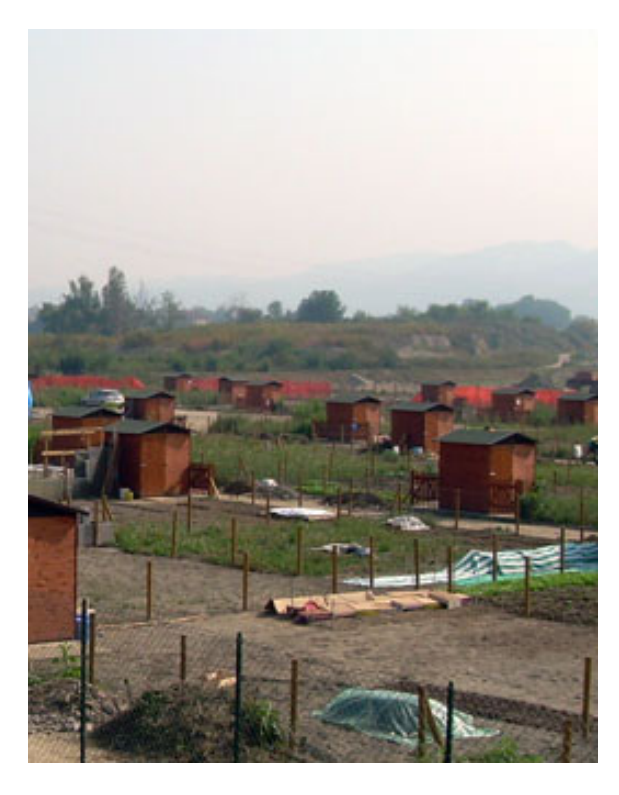
Fig. 2 The latter an example of TOCC project related to urban hortus