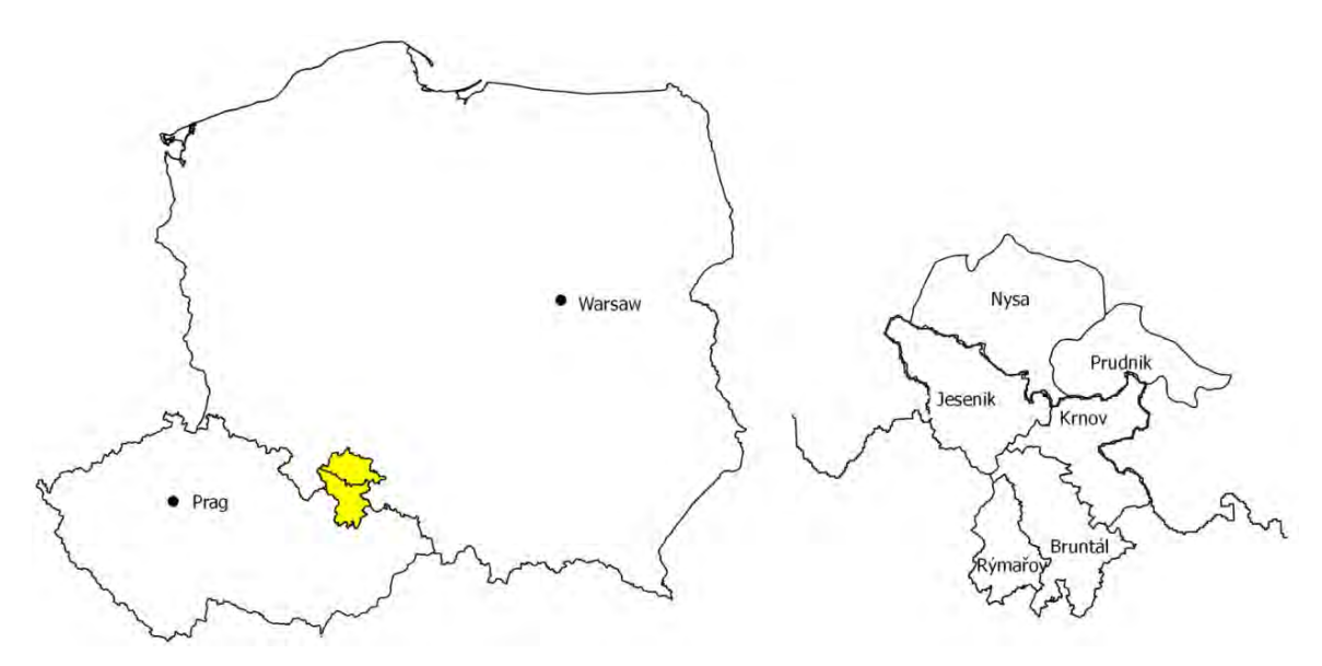
Fig. 1 Location of the studied region

The paper analyze the case study of the part of Euroregion Pradziad. The Euroregion is located between Poland and Czech Republic. The studied part of the Euroregion Pradziad covers an area of two Polish districts: Nysa and Prudnik and Czech district Jesenik and commune Krnov, Bruntál and Rýmařov (Fig. 1).