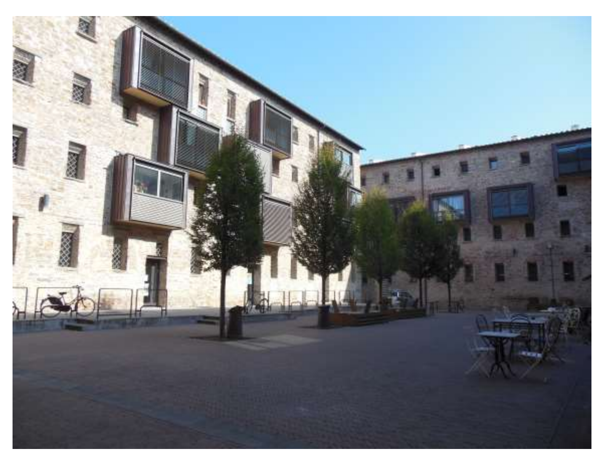
Fig. 2 Piazza delle Murate, core of the Urban Park of Innovation "Le Murate"

One such project was the framework MyFirenze , promoted by the City of Florence and activated since 2014 in the Multimedia Centre for City Visitors to Santa Maria Novella train station. It is realized in collaboration with the Media Integration and Communication Centre (University of Florence) and its aim is to enable tourists to plan their trips and optimise their time to visit the city. At first, the tourist finds the information at the tourism information centre and he/she defines the trip itinerary using natural interaction systems (tabletop and wall); then the personal plan is visualized on his smart phone, enabling access to advanced services and for updating the itinerary.