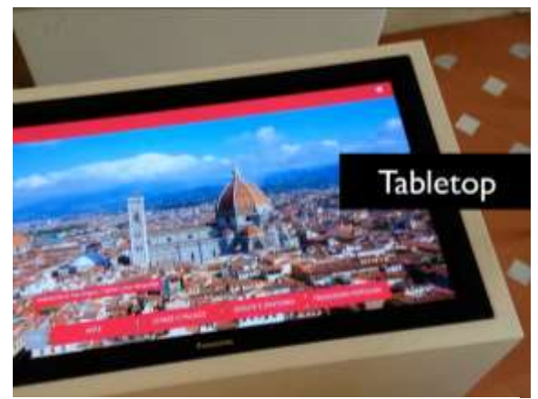
Fig. 3 The wall and the tabletop of framework MyFirenze at the Multimedia Center for City Visitors of Santa Maria Novella train station