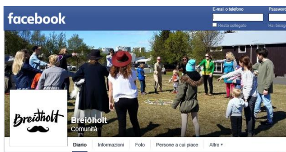
Fig. 4-5 The Breiðholt (on the left) an the Breiðholt Facebook Page (on the right)

A key focus of the Breiðholt Project is Gerðuberg, and the use of existing facilities and people to provide new services. Integral to this was the Culture Centre: a multifunctional facility for citizens, which hosts a library, activities for elderly people, sewing and carpentry laboratories and spaces for numerous activities organised by citizens. Through an initiative called Education Now, Icelandic courses were created, held at this building. This comprised of Icelandic and Leadership training for women. A further example is how the Kindergarten is used after hours for information-sharing surrounding bank loans and housing. The Elementary School is also used by parents to teach their children their mother tongue. An environment was created that could be