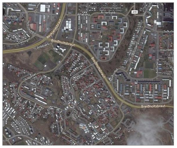
Fig. 2-3 The structure of the Breiðholt district (on the left) and arial view of the Breiðholt district (on the right)

Breiðholt is a multicultural district, and is uniquely diverse within the national context, both with regards to income dispersion and nationalities of its inhabitants. The neighbourhood has over 21,000 inhabitants (approximately 17% of Reykjavík inhabitants), of which 3,700 are immigrants (Iceland Review, 2015). Breiðholt has the highest proportion of low income households and immigrants in Reykjavík. For instance, 5% of its population emigrated from Poland; 80% of children in Ösp kindergarten do not speak Icelandic as a first language; 25% of families in one neighbourhood are immigrants, and long-term residence of families is characteristic. The age pyramid is even, and there is a mixed social and educational standing. Issues of language and social exclusion have been prevalent since the establishment of the neighbourhood in the late