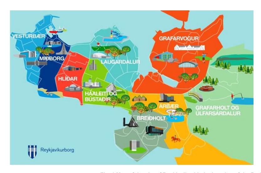
Fig. 1 Map of the city of Reykjavik with the location of the Breiðholt district insert

During the 1960s, Reykjavík underwent an unprecedented boom, and in 1962 the city began to implement zoning plans. Due to population pressure, development plans were published for Breiðholt in 1966 in the hills east of the city, with the idea of building single-family houses and low-priced apartments mixed together (Conolly and Whelan, 2012). Breiðholt was divided into three smaller neighbourhoods. The first part (lower-Breiðholt), was established between 1966-1973, the second in 1980, and the third in 1985. In 1999, Breiðholt was the highest populated area in Reykjavík with 22,030 inhabitants, but as of 2012 the population had fallen to 20,546 (Statistics Iceland, nd).