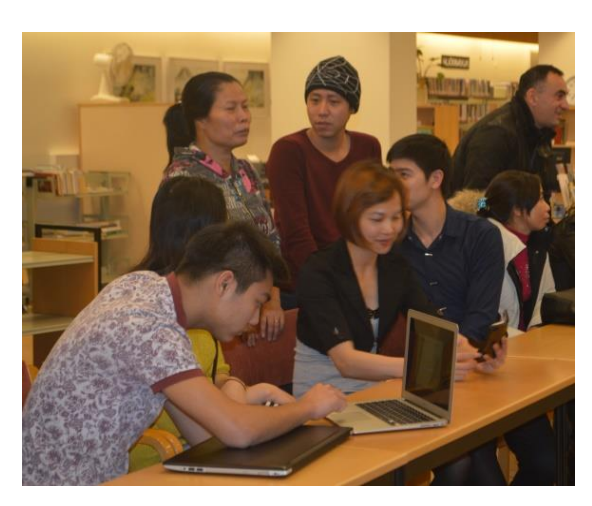
Fig. 6-7 The Culture Centre of Gerðuberg in Breiðholt (on the left) and activities to engage the immigrants in Breiðholt (on the right)