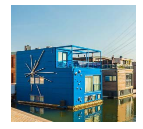
In this number NEW PRACTICES AND EXPERIENCES FOR PLANNING THE RESILIENT CITY