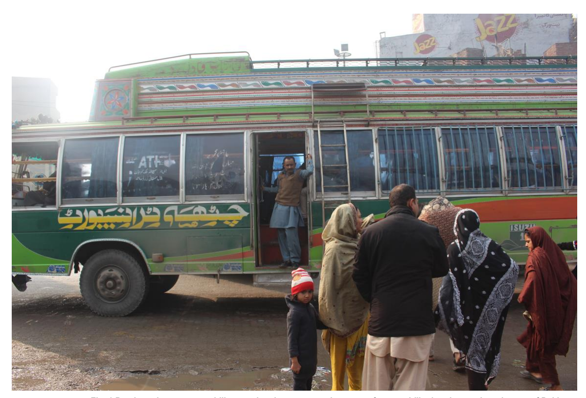
Fig. 1 Bus based transport mobility remains the most popular mean of automobility in urban and rural areas of Pakistan