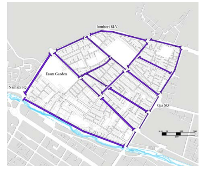
Fig. 1 Segments defined by the walkability audit tool

Tab. 4 Reliability of the collected data