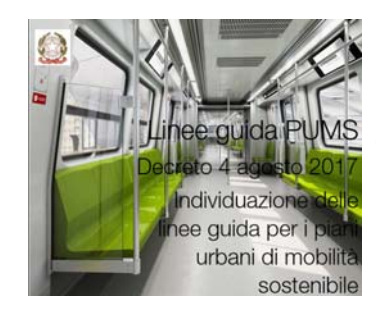
Guidelines for drawing up PUMS

To support the achievement of the objectives of the National Strategic Framework, in its various forms, Legislative Decree 257/2016, regulates the implementation of Directive 2014/94 / EU on the construction of an infrastructure for alternative fuels, moreover, the article 3 paragraph 7 letter c , explicit not only the adoption of measures aimed at creating the infrastructure for alternative fuels in public transport services, but also the adoption of guidelines for the preparation of urban plans for sustainable mobility (PUMS) to be implemented by decree of the Ministry of Infrastructure and Transport, subject to the opinion of the Unified Conference.