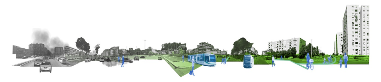
Fig. 4 Urban Regeneration: a transformation from polluted city to sustainable city. A conversion process to urban high quality

An example is the construction of the NZEB buildings, or the urban reforestation or the reduction of emissions that generally formulate the agenda of interventions establishing the starting conditions and requirements. Innovative technical solutions that embody the concept of environmental and social sustainability, combining the idea of natural inclusiveness within the building envelope. Same requests that are finalized in planning results that are not predictable or repeated. It is recurring to identify design solutions in which the facade is