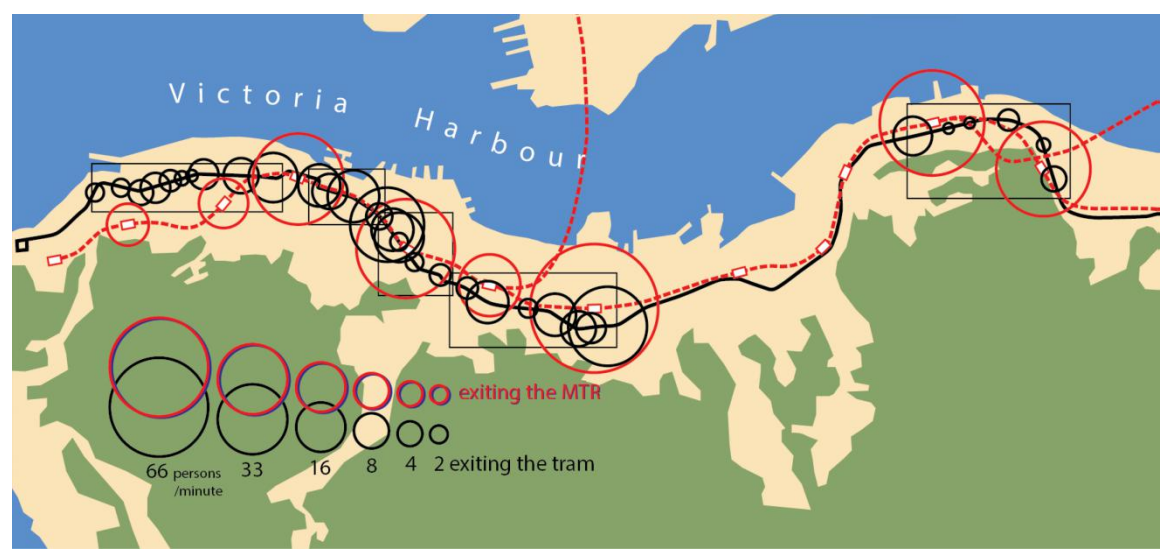
Fig.3. Disembarking tram rates sampled across store operating hours and metro station exit rates in the same time frame

- 25% of exiting passengers are at a single exit in Central, while 49% are at 4 of the 24 exits. This people flow suggests a more nodal form of development, with integrated high-density, mixed use development above stations (Zacharias & He, 2018). The MTR also generates pedestrian movement into the local street environment although a certain proportion of pedestrians exiting the station remain in the connected centre above, before returning to the MTR. Point generators may be much larger in the MTR system with a different distribution in the street environment than seen in the tram streets. These distinctions suggest the largely autonomous roles of each of the transport systems, with their different purposes and with little linkage between them.