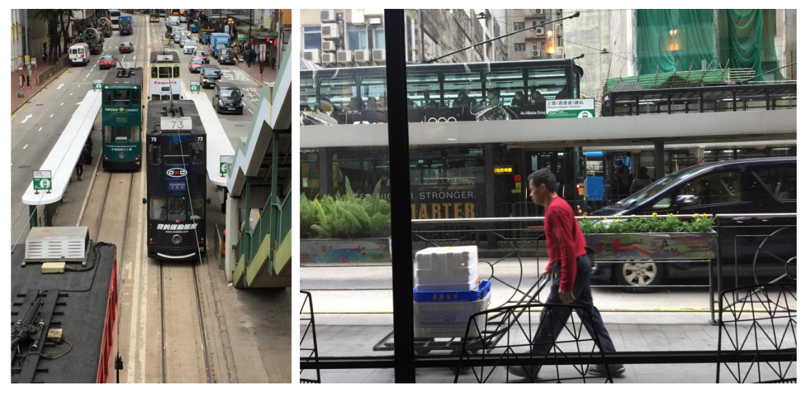
Fig.1. Tramway-street arrangements involve several channels in a narrow right-of-way

locations. In this way, the tramway corridor is a multiple mode system that is also characterized by streetfront commercial activity and strong pedestrian movement. In 2013, average daily ridership was 198,000 (Transport Department, 2014) (Fig.1), declining to 180,000 in 2019 after extensions to the MTR.