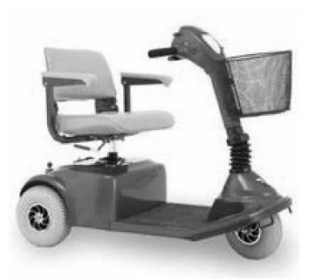
Fig.5 Even this three-wheeled device is a "special type of a vehicle for the transport of persons" not specially designed for the transport of disabled persons (source: Official Journal of the European Union L205 of 7 August 2009)

The vehicle can be disassembled into seven light components. It is designed for use at home, on footpaths and in public spaces, for activities such as shopping trips.