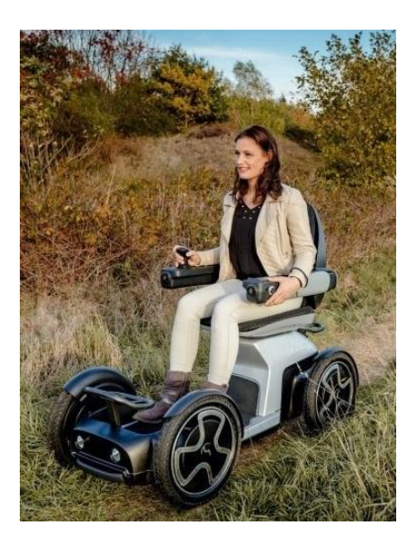
Fig.7 This device should be classified as mobility scooter because of the presence of a steerable front axle, even if it steers with a joystick