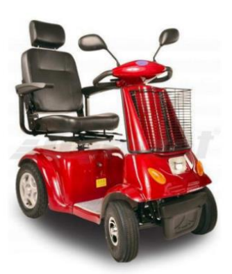
Fig.6 According to the EU Regulation 2021/1367, this device is to be classified as a motor vehicle similar to golf cars and may be used almost everywhere (source: Official Journal of the European Union L294 of 17 August 2021)

It is therefore to be classified under CN code 8703 10 18 as a motor vehicle principally designed for the transport of persons, similar to golf cars."