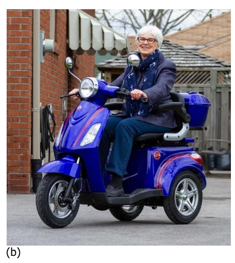
Fig.9 (a) from New Zealand; (b) from Canada