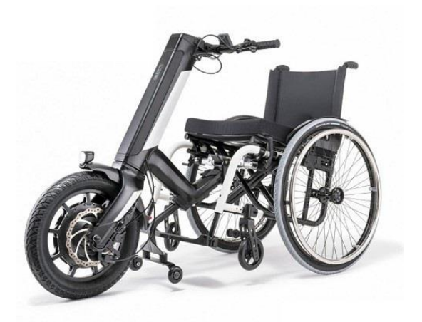
Fig.8 Manual wheelchair electrified by a front power assist drive unit with steering column: medical assistive device or motor vehicle?

We are available for any initiative aimed at raising awareness of the problem and of the need for a regulatory reform among the competent bodies, hoping that something similar to the "mobility scooter revolution" started overseas more than 40 years ago will also come out in Italy and worldwide.