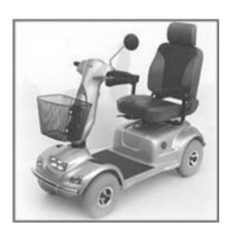
Fig.3 Instead this device with a steering column is a "motor vehicle principally designed for the transport of persons" (source: Official Journal of the European Union C1 of 4 January 2005)

However, motor-driven scooters (mobility scooters) fitted with a separate, adjustable steering column are excluded from this subheading. They can have the following appearance and are classified in heading 8703:"