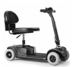
Fig.4 According to the EU Regulation 718/2009, this four-wheeled device is a "special type of a vehicle for the transport of persons" which is not specially designed for the transport of disabled persons and has no special features to alleviate a disability (source: Official Journal of the European Union L205 of 7 August 2009)

The vehicle can be disassembled into four light components. It is designed for use at home, on footpaths and in public spaces, for activities such as shopping trips.