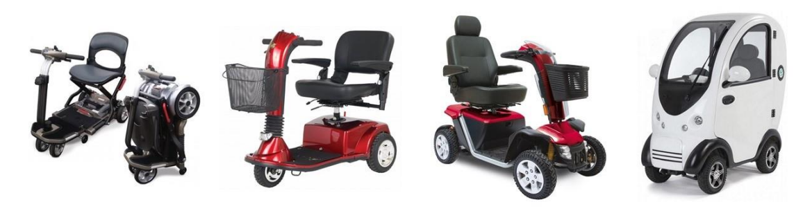
Fig.1 The various types of mobility scooters: portable, three-wheel, four-wheel, and cabin

The four-wheel mobility scooters ensure better stability: they are the fastest and most reliable models and are stable in the external environment on uneven surfaces, with a wider turning radius and less maneuverability. The cabin models are equipped with a closed body, which makes them almost as versatile as small cars.