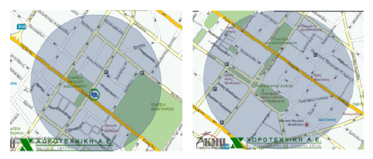
Fig. 1 Metro stations of Venizelou (left) and Agia Sofia (right)

The data were collected via questionnaires and interviews.