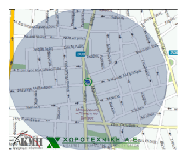
Fig.2 Buffer area of the metro station of Flemigk

The methodology of the study follows a simple pattern. Answers of the questionnaires are organized and inserted in Microsoft Excel. The most important year for the Flemigk station of 2009 as it was the year that the construction started in the area.