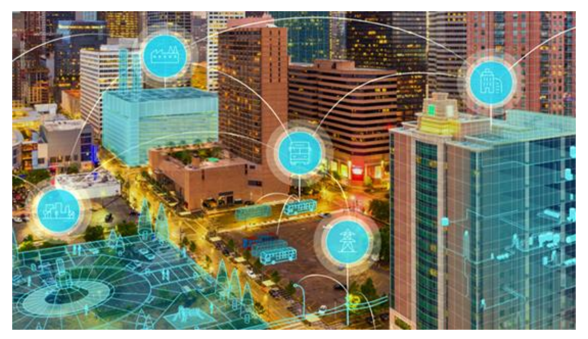
Fig.3 Representation of the digital space in Singapore