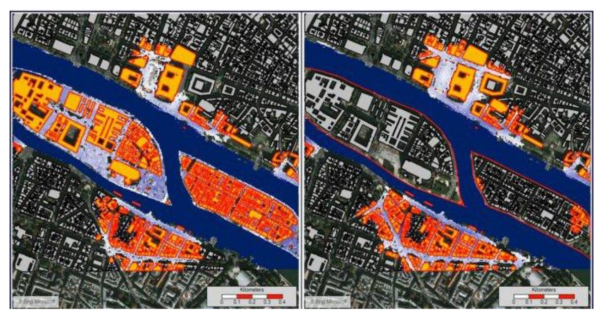
Fig.4 The Digital Twin of Lisbon. Flood simulation in downtown: two different scenarios

and also to assess and mitigation and resilience strategies for the new infrastructures. In addition, the city is now able to efficiently perform predictive analyzes of city supply, wastewater, stormwater and other water systems to predict flood risks and take necessary proactive actions and preventive measures before arrival of any wave of flood<sup>22</sup> (Fig.4).