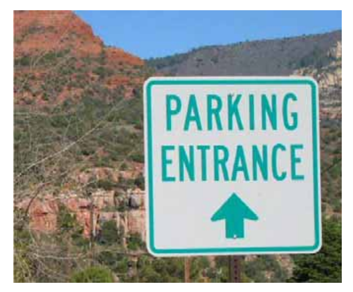
The location of parking facilities is a major issue of transportation planning.

phenomenon makes the increase of parking capacity desirable only for a limited amount until reaching an optimal level. After this limit, it makes the environmental quality of transportation gradually worsen, with higher demand for additional road capacity and even more parking capacity, which not always may be satisfied due to land availability constraints. Moreover, additional concerns are related to the adoption of land use patterns associated with huge parking facilities. They contribute to shape the new developments, in particular in suburban areas, with the formation of a more car-dependent mobility and a reduction in the accessibility by walk/public transportation. The process determines the formation of large energy intensive (and energy wasting) systems, with associated lower quality of life and environmental decay.