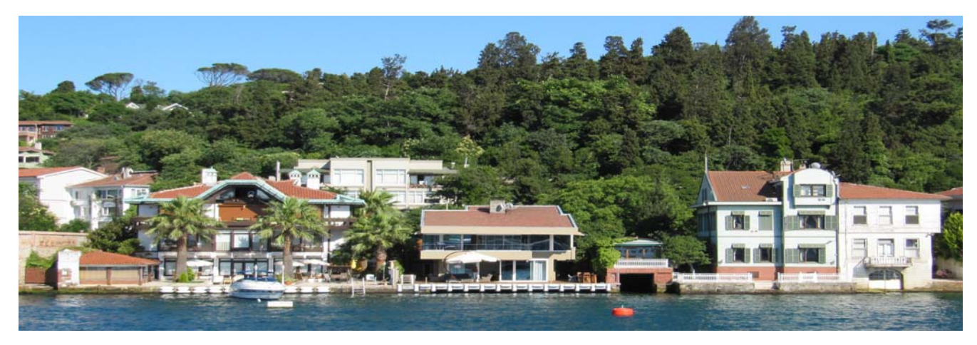
Residences on the Bosphorus shore.

the newly established Ministry of Environment and Urbanism that the new Financial Centre of Istanbul at the Anatolian Side will be built for attracting Islamic Banks, and Islamic Development Bank funds may be used for the construction. It was addressed that Build and Operate (BO), Build, Operate and Transfer (BOT) models would be used and entrepreneurs should be involved in. Hints are given in the speech that the costs will be covered by the income to be created through marketing and/or operation of residential buildings, touristic facilities, congress and cultural centers, office buildings, shopping malls, tolls of motorways and bridges, port and airport taxes and fares.