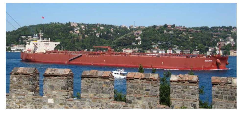
Vessel passing through the Bosphorus Strait.