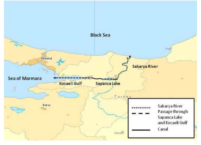
The Path of the Canal Project in the Ottoman Period.

on this assumption putting emphasis on international treaties such as the "Montreux Convention Regarding the Regim of the Turkish Straits" signed in 1936, and associated sea conventions. However, the reality is that the project is actually a large, complex project as presented initially by PM Erdogan during the election speech on late April 2011. The project is claimed to be multidimensional: "...is an energy project, ...a transportation project, ...a development project, ... an urbanization project, ...an environmental protection project". And it is unique for its grandiose: "....this project, which cannot even be compared to those like The Panama Canal, The Suez Canal, or the Corinth Canal...".