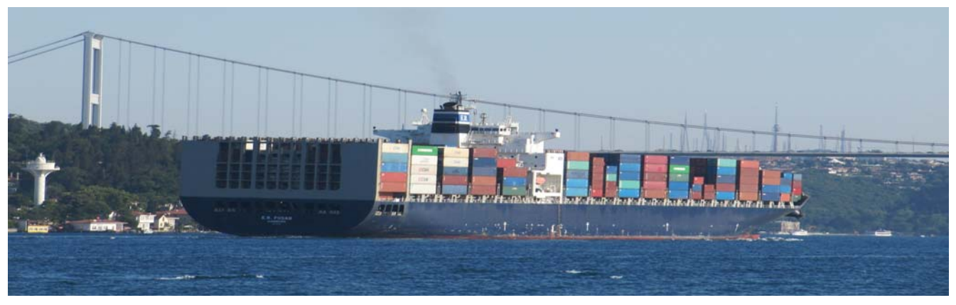
Vessel traveling from the Black Sea to the Sea of Marmara.