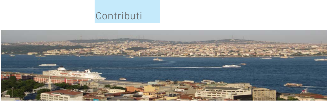
Intra-city sea traffic in the Bosphorus.

designated forest protection areas in the Master Plan of Istanbul, and overlapped the image provided by the newspaper by georectification process. There was no reference to the source of the image in the newspaper. After the georectification process, we observed that the green areas belonging to the Treasury of Turkey perfectly match the designated forest protection areas in the Master Plan. Strikingly, in the news, it was praised that about 96.4% of the area will be freely acquired for construction since it is publicly owned. Thus, to our opinion this news strongly reduces the credibility of the project about its sensitivity on environmental assets.