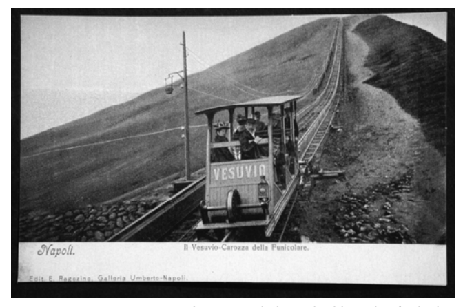
A post card about the Vesuvius funicular.

Many cities and metropolitan areas are now reconsidering the possibility of creating local public transport connections by using the ropeway. The cable transport also provides for other transport systems, in particular the cable cars which allow the overcoming of strong gaps and slopes inside urban areas. Unlike the "funicular", cable cars do not foresee a shift in "pending" but overland and the cars run on tracks that pass through the drop by means of a driving force exerted by a "pull and release" cable , which pulls the downstream car and at the same time releases the upstream cabin. Naples is definitely the most famous Italian city for funicular public transport. Currently there are four different funiculars allowing to reach the hills of Vomero and Posillipo from the old city and from the areas of Chiaia and Mergellina. Funicular installations are active in many other "oblique" Italian cities, like: Genova, Bergamo, Biella, Como, Trieste, Livorno (solar powered), etc.