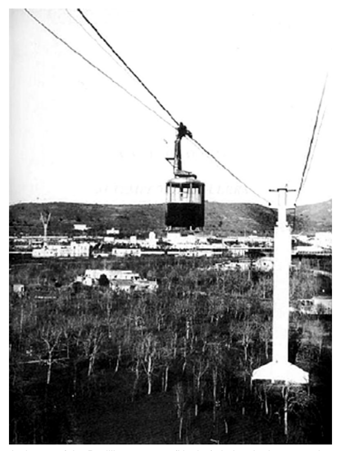
An image of the Posillipo ropeway (Naples) during the last operating period.

Valentino and Cavoretto stations, also to recall, 150 years from the Unification of Italy, the sense of the 1961 exposure which tried to propose a new modernity for Country being also an expression of a century of unity of its people. Even in the case of Naples the cableway connecting the hilly area of Posillipo to Fuorigrotta district was released at the inauguration of the "Overseas Exhibition." The great international exposition, with the original title of "Triennial Exhibition of Overseas Italian countries, collected the products of the art of Italian colonies in North Africa and the Mediterranean. The large exhibition center, which gave rise to extensive changes in our urban area west of Naples, was built as a twin settlement of the EUR in Rome and was inaugurated by King Vittorio Emanuele on 9 May 1940.