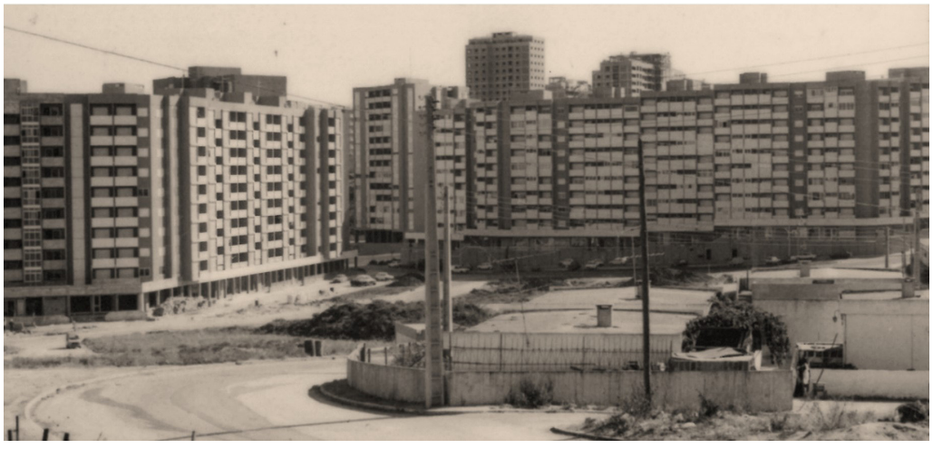
Fig. 5 - The urbanisation and construction of the Alfornelos neighbourhood - 70s/80s