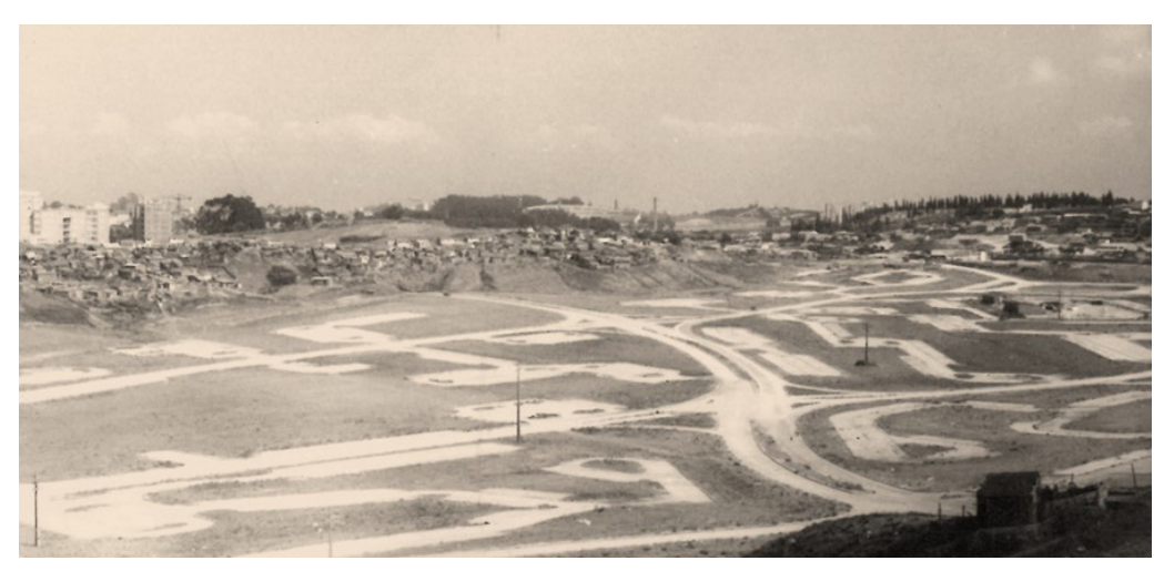
Fig. 4 - Brandoa neighbourhood - the start of urbanisation work (1970s)

a new "Preliminary Urbanization Study of Casal de Alfornelos" was submitted by a different team, led by architects Correia Simões and Nunes de Oliveira, along with civil engineer M. Rodriguez Cuña. This study considered the constraints of Lisbon's Regional Master Plan, particularly regarding the proposed major regional transport routes that would cross the property—such as the port road and railway belt—as well as potential urban areas. Additionally, the Lisbon Master Plan's radial road connecting to the port access road at the Venda Nova junction was included. The study proposed two roundabout junctions, addressing the considerations of the master plans. The proposal was approved with the indication that the Autonomous Roads Authority should be the one to develop the intermunicipal road layout project (Proc. 1221/65).