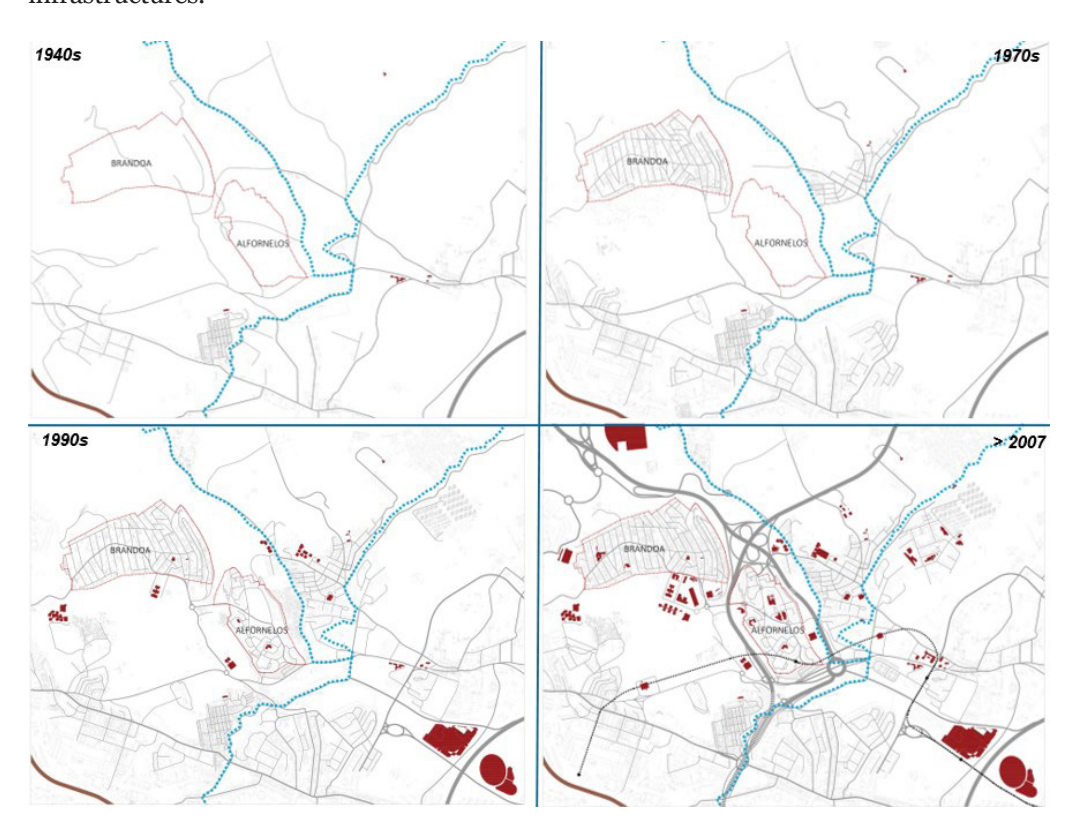
Fig. 7 – Brandoa and Alfornelos: Evolution of urban neighbourhoods' development from 1945 to post-2007

In the 1940s none of the neighbourhoods existed; at the beginning of the 70s, the Brandoa neighbourhood was practically fully occupied and had only one access road, while Alfornelos began its process of infrastructure development, which would be consolidated in the 8os and 9os. Access routes became more fluid between neighbourhoods and between municipalities; from the 2007s onwards, the neighbourhoods were consolidated and new facilities were created, while at the same time there was major investment in crucial road infrastructures.