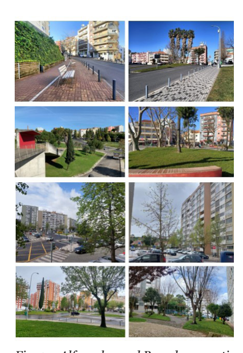
Fig. 9 – Alfornelos and Brandoa - continuity of public space/urban continuity: 2023/24