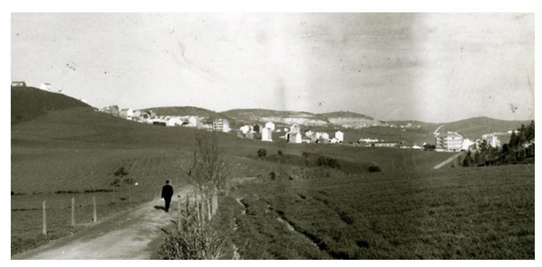
Fig. 3 - Brandoa neighbourhood in the 1960s

Speculation grew, both in the sale of plots and their subdivision, leading to rising land prices and rents. Buildings became even higher, with one example reaching 10 floors (Bruno Soares and Dores, 1984).