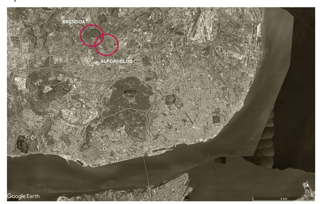
Fig. 1 - Northern Lisbon: Location of Brandoa and Alfornelos

Public and private, small and large, regular and informal housing developments began to appear, occupying rural areas and pushing urban development forward. This urbanization process formed the most common residential fabric in the Lisbon Metropolitan Area and represented a broader urbanization trend.