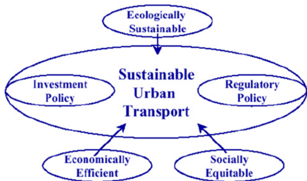
Figure 2: Desirable System of Sustainable Transport

Transportation planning defines future policies, goals, investments and designs to prepare for future needs to move people, goods and services to destinations (Beatley, 1995). Planning is a collaborative process that incorporates the inputs of many stakeholders such as government agencies, the public and private businesses (Litman, 2014). It is concerned with the design, location, evaluation, analysis and assessment of transport routes, infrastructure and facilities. Planning involves, observing current conditions, in the case of Harare the last time the roads were repaired is important; projecting future population and employment growth i.e., evaluating anticipated land uses in the region and identifying major growth corridors; detecting current and projected future transportation problems and needs; analysis is done through comprehensive planning studies, various transportation improvement strategies to address those future needs; developing long-range plans and short-range programmes of alternative modes of transport; injection of capital and operational tactics for moving people and goods within