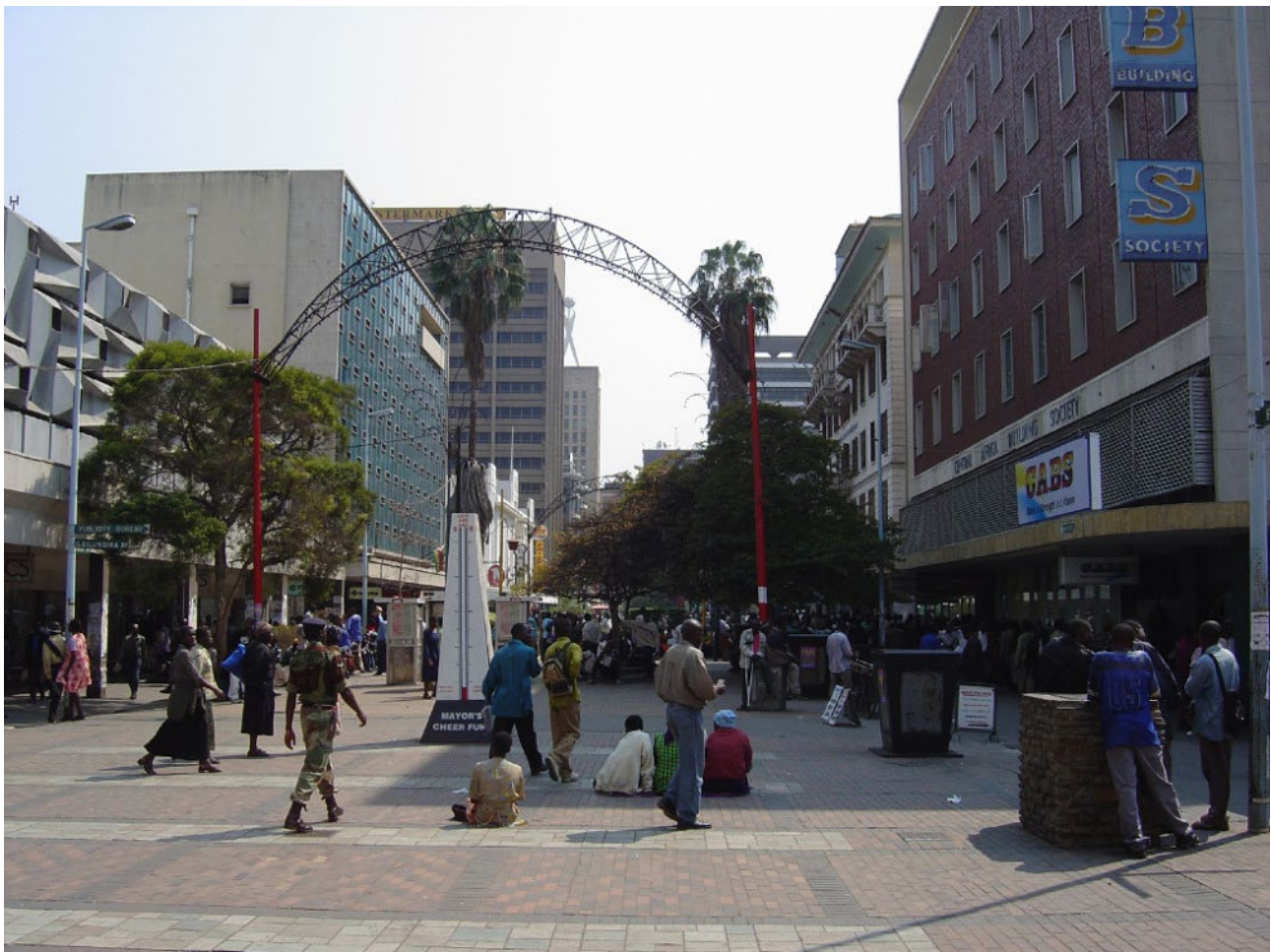
Figure 3: First Street, Harare.

(ZINARA) role is to fix, collect, disbursing road user charges and mobilisation of revenue for roads development and maintenance including the monitoring of such funds disbursed for road maintenance to road authorities. ZINARA took over collection of these fees in 2009, Fuel Levy, initially collected by National Oil Infrastructure Company of Zimbabwe (NOIC) and transit fees, overload and abnormal load fees originally collected by Vehicle Inspectorate Department (VID). At ZINARA major constraints exist, corruption, nepotism, high staff turnover, low remuneration levels, and the organisation is not well placed to attract the required skills. The major constraint is few disbursements of financial resources to local authorities, especially to the CoH since more than 80% of Zimbabwe's vehicles are found within the greater Harare urban environs. ZINARA's work is not visible in the CoH. The Zimbabwe Republic Police (ZRP) maintains law and order. Its National Traffic Branch provides a road policing service which entails enforcement