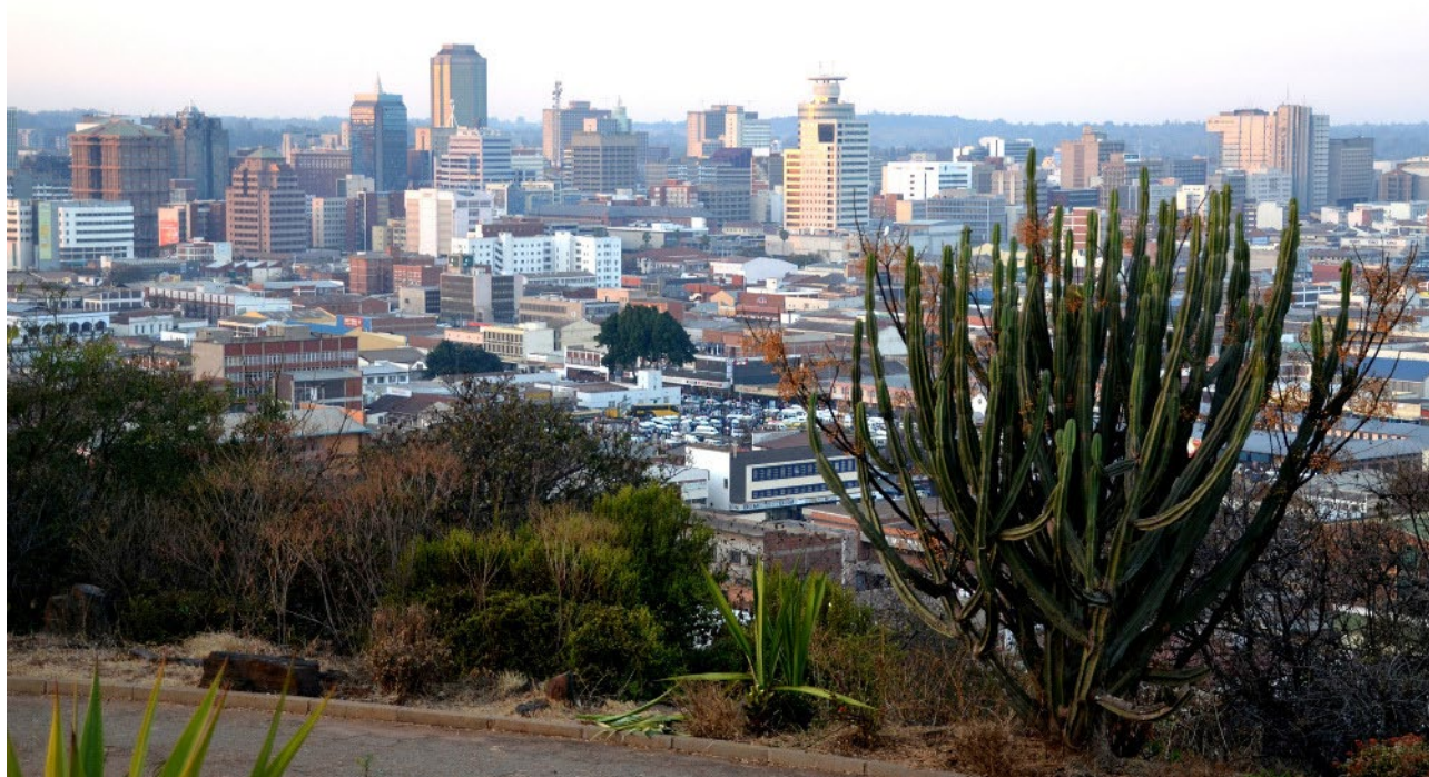
Figure 1: Harare’s skyline.

by all, including distressed communities. Essentially, a socially equitable transport system should meet the needs of the marginalised (African Development Fund, 2013). Efficient transportation system analyses the comparative mode of transport versus another. Trucks are generally faster though breakdowns and accidents may occur.